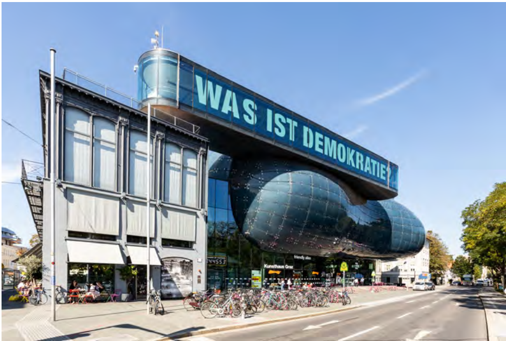
"What Is Democracy?". Installation view: "What Is Democracy?" (solo show), Kunsthhaus Graz, Graz, 2019

"What is democracy?" is not one question, but is actually two questions. On the one hand, the question relates to conditions of the current, parliamentary representative democracies that are scrutinized critically in this project. On the other hand, the question traces different approaches to what a more democratic system might look like and which organizational forms it could take.