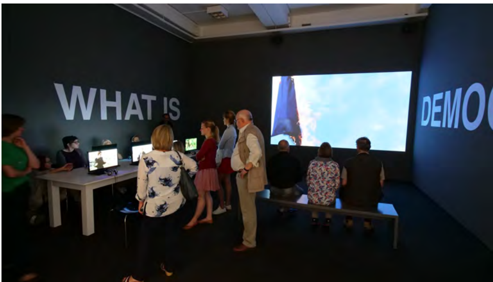
"What Is Democracy?". Installation view: "Antidoron – The EMST Collection", Documenta 14, Kassel, 2017