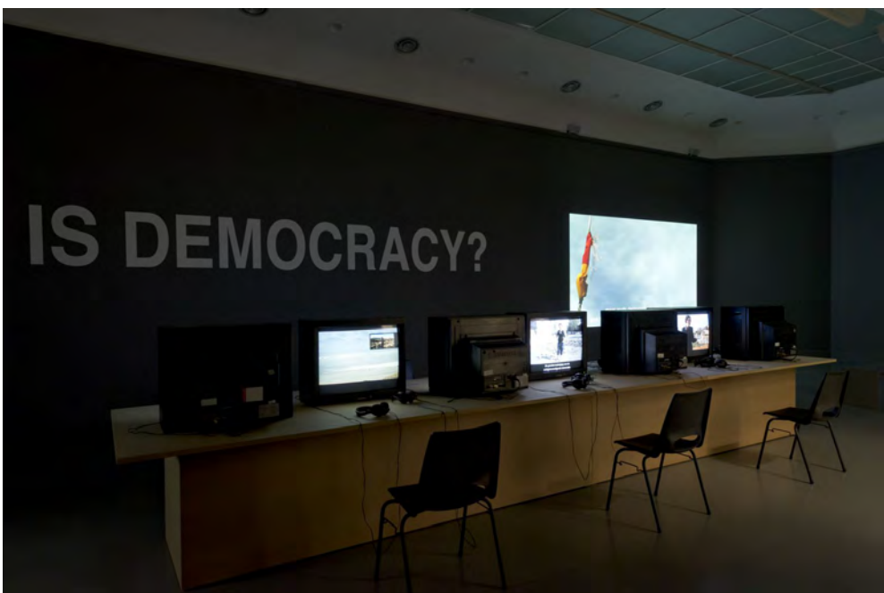
"What Is Democracy?". Installation view: "Play Van Abbe Part 4 – The Tourist, the Pilgrim, the Flaneur (and the Worker)", Van Abbe Museum, Eindhoven, 2011