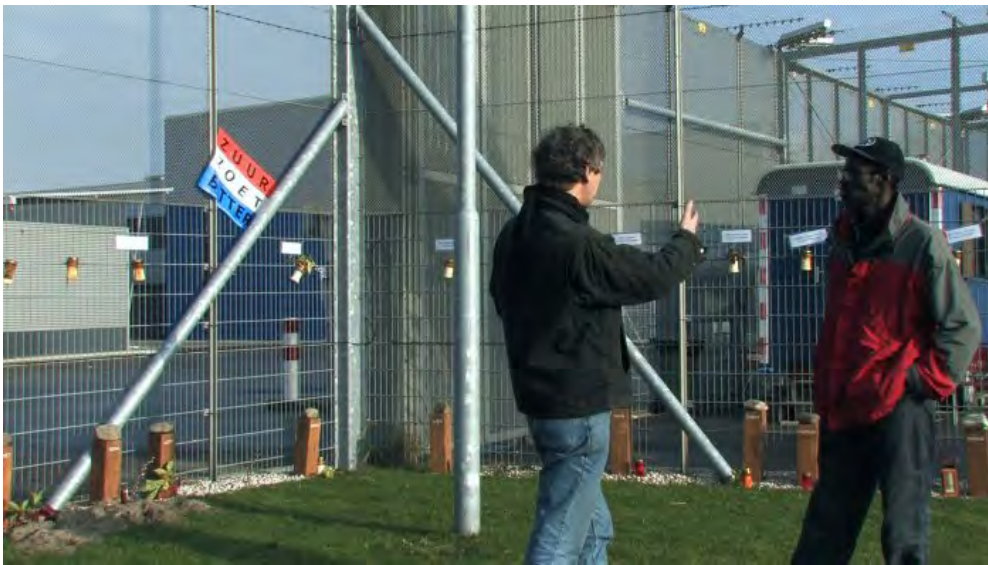
"What Is Democracy?", still