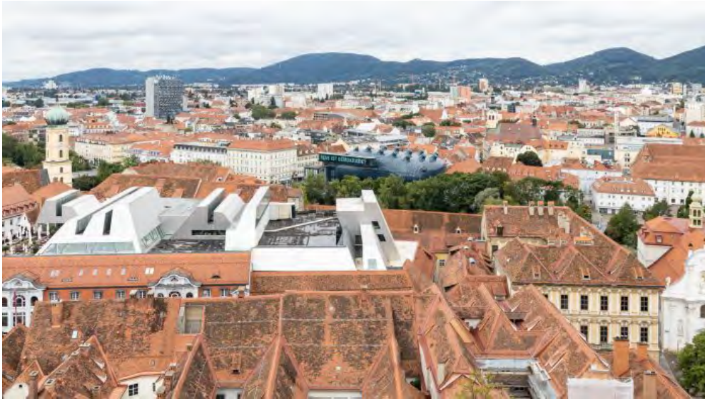
"What Is Democracy?". Installation view: "What Is Democracy?" (solo show), Kunsthhaus Graz, Graz, 2019

Graz, Otto-Mauer-Fonds, Biennale de Lyon 2009