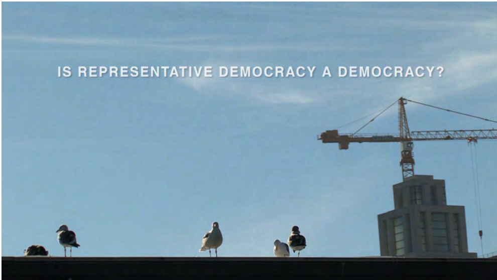
"What is Democracy?", still