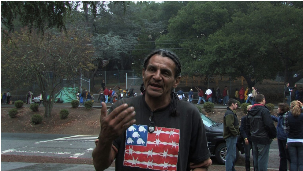
"What is Democracy?", still