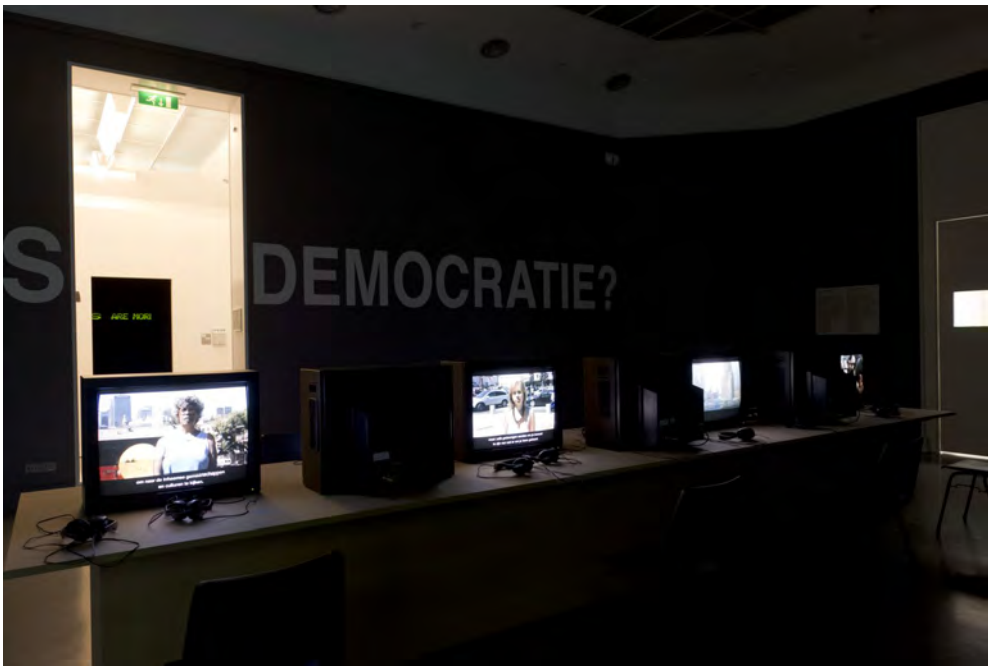
"What Is Democracy?". Installation view: "Play Van Abbe Part 4 – The Tourist, the Pilgrim, the Flaneur (and the Worker)", Van Abbe Museum, Eindhoven, 2011