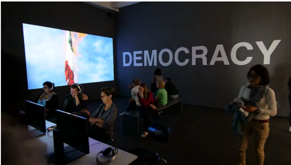
"What Is Democracy?". Installation view: "Antidoron – The EMST Collection", Documenta 14, Kassel, 2017