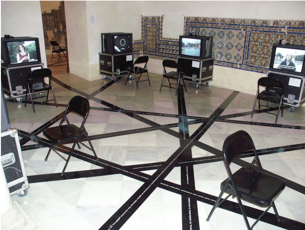
“Alternative Economics, Alternative Societies”. Installation view: “The Unhomely: Phantom Scenes in Global Society”, Second International Biennial of Contemporary Art, Seville, 2007