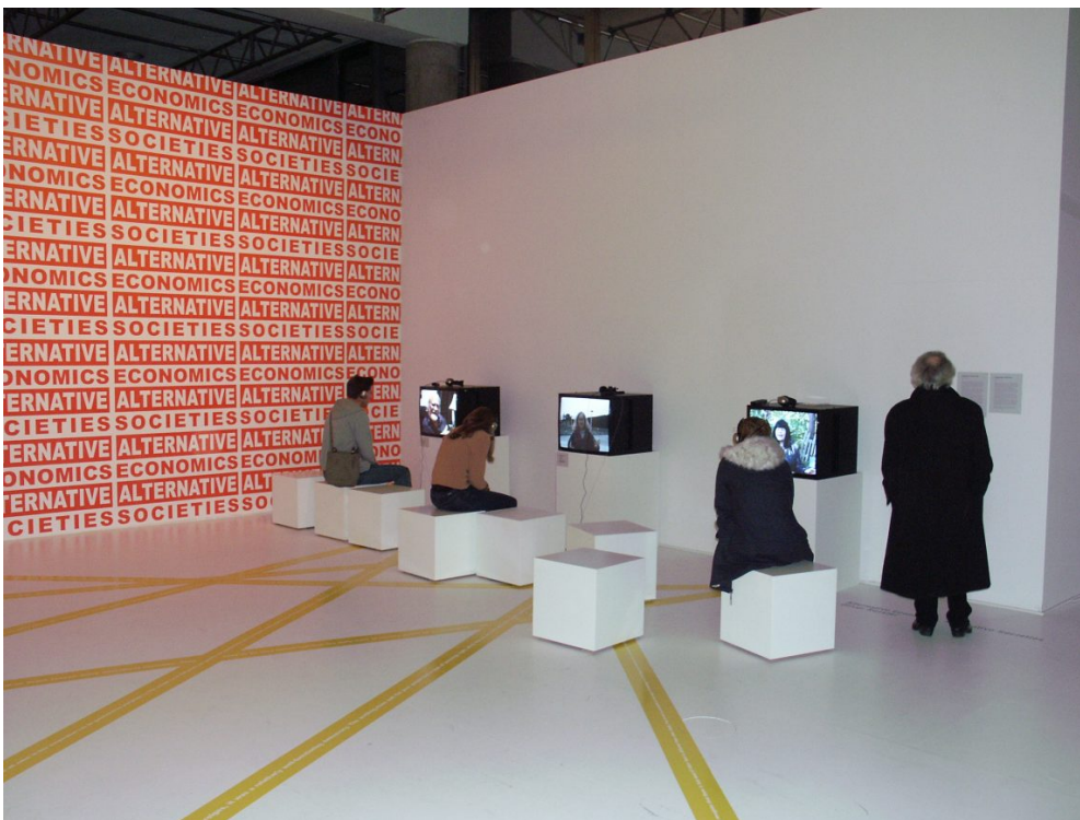
"Alternative Economics, Alternative Societies". Installation view: "fly utopia!", Transmediale.04 – International Media Art Festival, Berlin, 2004

After the loss of a counter-model for capitalism – which socialism, in its real, existing form had presented until its collapse – alternative concepts for economic and social development face hard times at the beginning of the twenty-first century. In the industrial nations, broadly discussed are only those “alternatives” that do not question the existing power relations of the capitalist system and representative democracies. Other socio-economic approaches are labeled utopian, devalued, and excluded from serious discussion, if even considered at all.