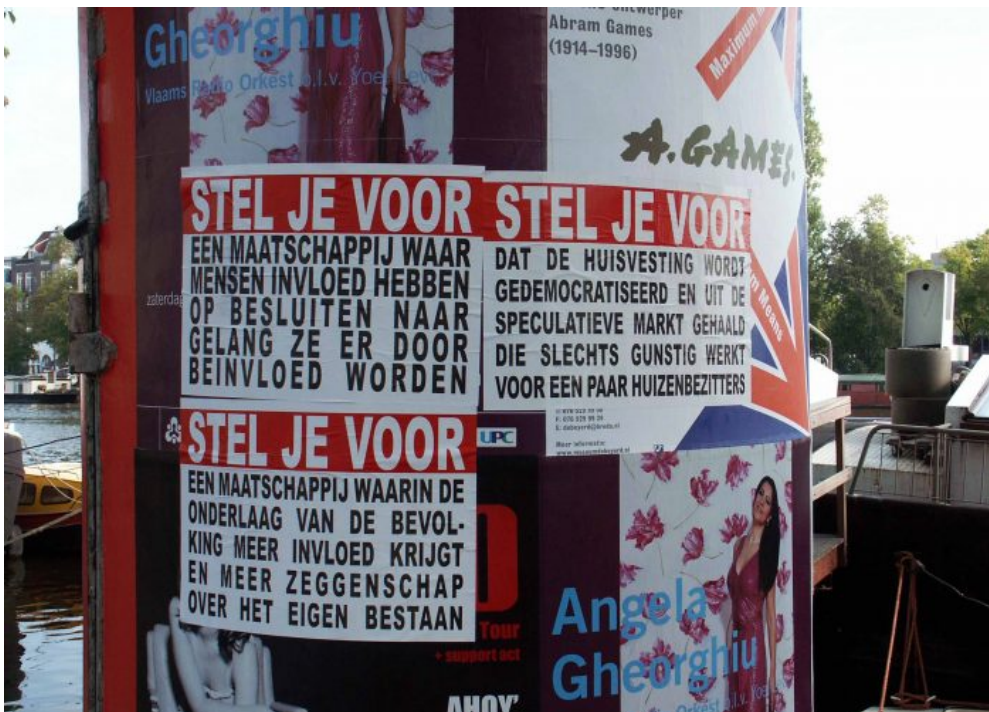
"Alternative Economics, Alternative Societies". Installation view: "Quicksand in De Pijp", SKOR, urban space, Amsterdam, 2004

The installation was extended through billboards, posters and banners carried out in several languages.