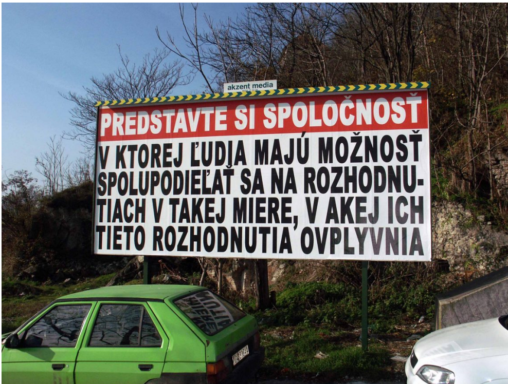
"Alternative Economics, Alternative Societies", billboard, Bratislava, 2004

Chosen from each of these 16 videos is one quotation significant for the alternative model that it presents. The quote is placed directly on the floor of the exhibition room as a several meter long text piece. This floor lettering, made from adhesive film, leads exhibition visitors directly to the corresponding videos and thereby provides a kind of orientation within this non-hierarchically arranged pool of videos. These videos offer stimulus and suggestions for contemplating social alternatives and possibilities for action.