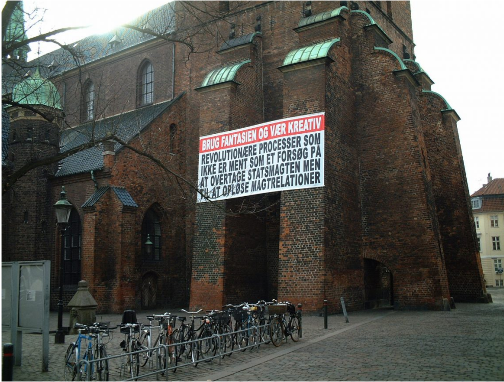
"Alternative Economics, Alternative Societies", banner: "Re-Act", Nikolaj Copenhagen Contemporary Art Center, Copenhagen, 2005

The whole exhibition project started in Ljubljana in 2003 with five videos and has grown to include 16 videos with a total length of more than seven hours.