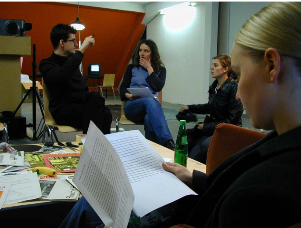
"Border Crossing Services". Seminar at Universität Lüneburg, 2001