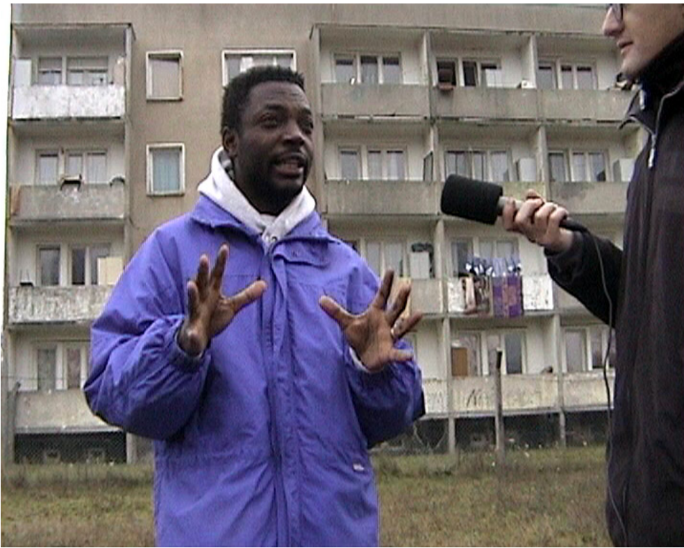
"Border Crossing Services", still