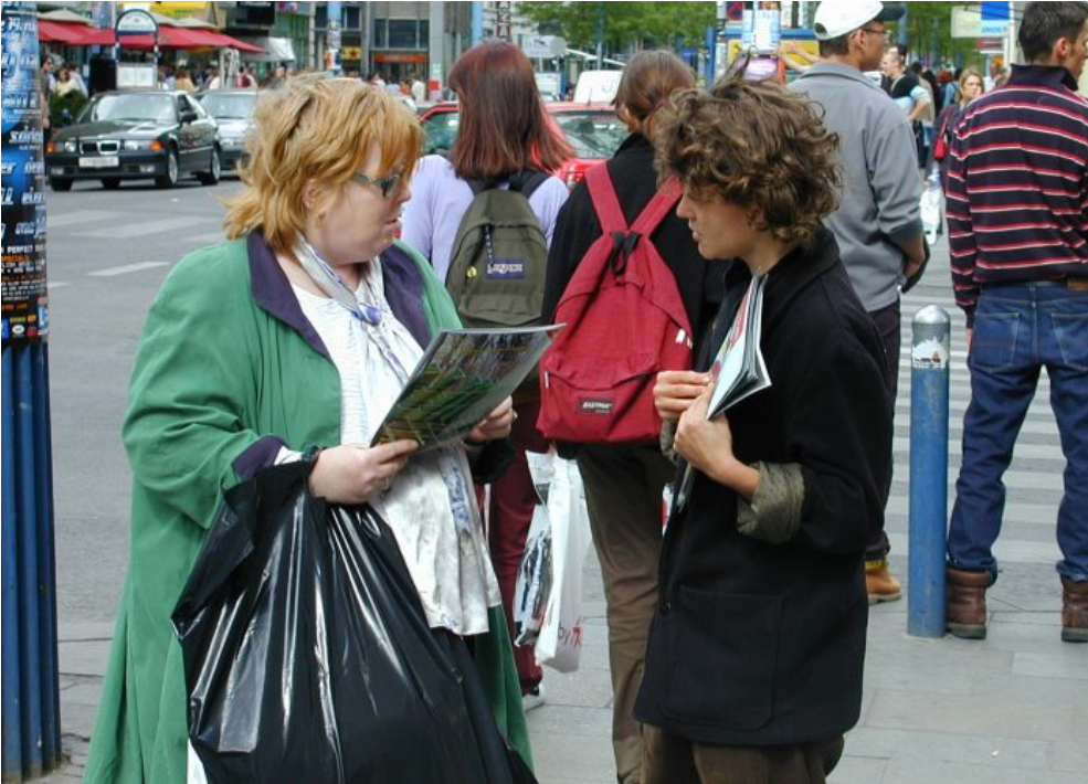
"Border Crossing Services". Distribution of the direct-mailing "Neues Grenzblatt" in public space, 2001

literature, which together with anti-racist magazines form a theoretical framework for the individual elements of the exhibition.