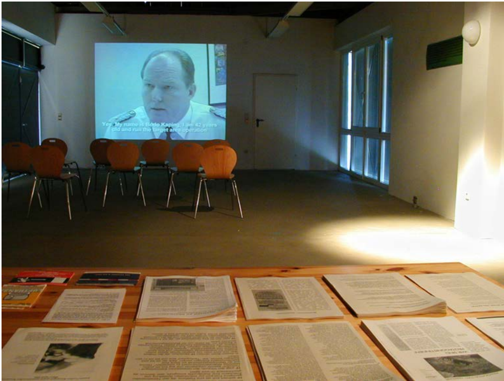
"Border Crossing Services". Installation view: "Dienstleistung: Fluchthilfe", Pavelhaus, Laafeld, 2001

Starting from a block seminar which we carried out at the University of Lüneburg, participating students formed a self-organized project group. In order to counteract the hierarchical relations which can possibly develop in the cooperative work between artists and students, we decided to present together the works which we co-produced, the independently produced contributions of the project groups and our own exhibition contributions in a commonly created exhibition framework. All of the exhibition contributions were discussed in working meetings held at various stages of development. Thus, critique could subsequently be integrated into the later stages of the production process.