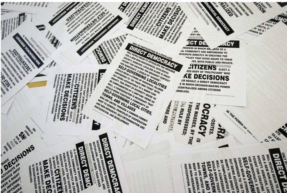
"Fly Democracy", Installation view

The "Fly Democracy" installation represents a re-enactment of this shower of message-bearing flyers, but symbolically transfers the drop's target point to the territory of the United States. Specially drawn up for the "Fly Democracy" piece, ten flyers set forth current political arguments on behalf of direct or participatory forms of democracy, all of which stand in contradiction to the model of formal democracy that – embedded in a neo-liberal, capitalistic State – is imposed by the United States. The stance that "Fly Democracy" adopts contrasts with that model by interpreting the term "democracy" more in its original sense, as it was understood in Ancient Greece. At that time, it meant – at least for full age male citizens – more direct involvement in the decision-making processes than what exists in today's representative democracies. "Pseudo-democracies" is how the theorist Paul Cockshott would label the latter, as measured against the word's original meaning.