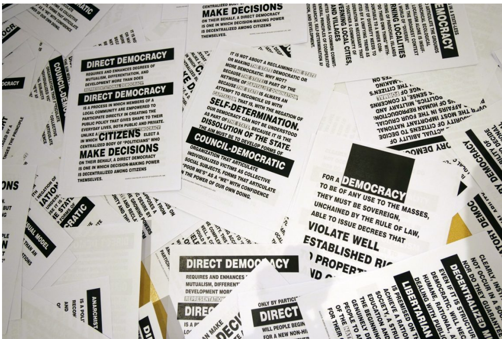
"Fly Democracy", Installation view