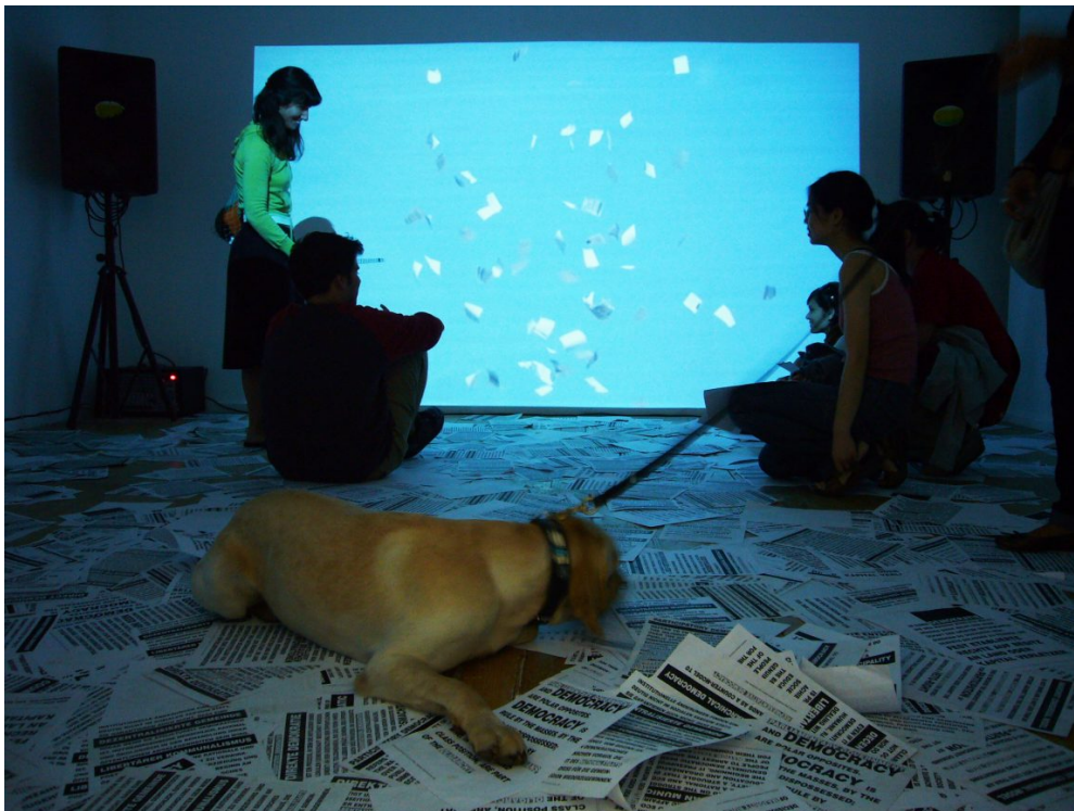
"Fly Democracy". Installation view: "On the outside", ACC Galerie, Weimar, 2007

The installation consists of a five-minute video loop showing the flyers on their downward trip from a shining blue sky to the ground, where they are read by people who pick them up. The original English-language flyers are strewn on the floor in front of the video screen, together with the exhibition-destined flyers in German, French or Romanian. Visitors are welcome to pick any of the flyers up, read them and take them home.