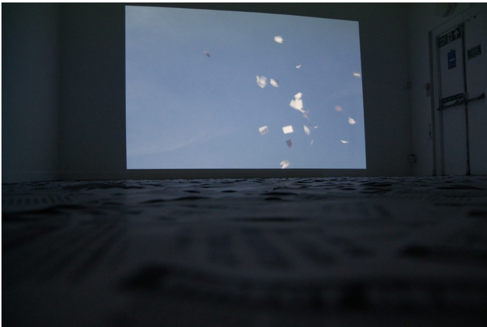
"Fly Democracy". Installation view: "What Is Democracy?" (solo show), Peacock Visual Arts, Aberdeen, 2010

The "Fly Democracy" installation represents a re-enactment of this shower of message-bearing flyers, but symbolically transfers the drop's target point to the territory of the United States. Specially drawn up for the "Fly Democracy" piece, ten flyers set forth current political arguments on behalf of direct or participatory forms of democracy, all of which stand in contradiction to the model of formal democracy that – embedded in a neo-liberal, capitalistic State – is imposed by the United States. The stance that "Fly Democracy" adopts contrasts with that model by interpreting the term "democracy" more in its original sense, as it was understood in Ancient Greece. At that time, it meant – at least for full age male citizens – more direct involvement in the decision-making processes than what exists in today's representative democracies. "Pseudo-democracies" is how the theorist Paul Cockshott would label the latter, as measured against the word's original meaning.