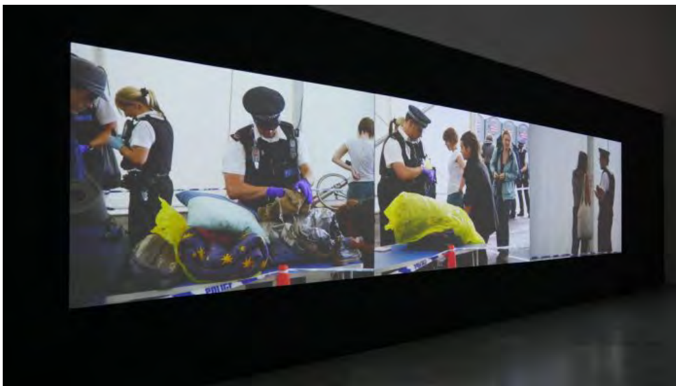
"For a Completely Different Climate". Installation view: "We will beg for nothing, we will ask for nothing. We will take, we will occupy." (solo show), Centro Andaluz de Arte Contemporaneo – CAAC, Seville, 2015

Due to the successful protests, the station of Kingsnorth finally closed on 17 December 2012 in the framework of the EU's Large Combustion Plant Directive (LCPD) and the demolition commenced on October 2014.