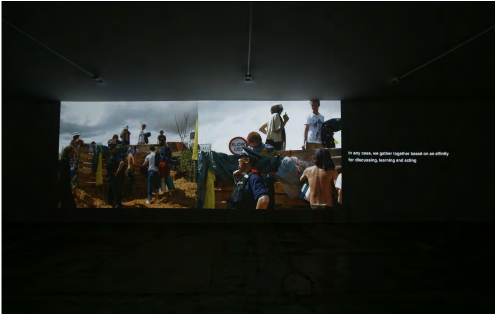
“For a Completely Different Climate”. Installation view: “For A Completely Different Climate” (solo show), Galleria Artra, Milan, 2008

“For a Completely Different Climate” deals with an emerging social movement that questions and selectively fights the response (or non-response) of states and corporations to climate change. This leftist movement has the potential to mobilize especially in the UK, where in August 2008 a Climate Camp was organized to close the Kingsnorth coal-fired power station east of London. Although the Kingsnorth station will be shut down, the energy corporation E.ON plans to build, at the same location, a new coal-fired power station that will assure profits for the next few decades. This project completely conflicts with the necessary goal of reducing CO2 emissions. Preventing a new coal-fired power plant in Kingsnorth is of great symbolic value, since a successful resistance could mean the end of other planned projects for coal-fired power plants elsewhere in Britain.