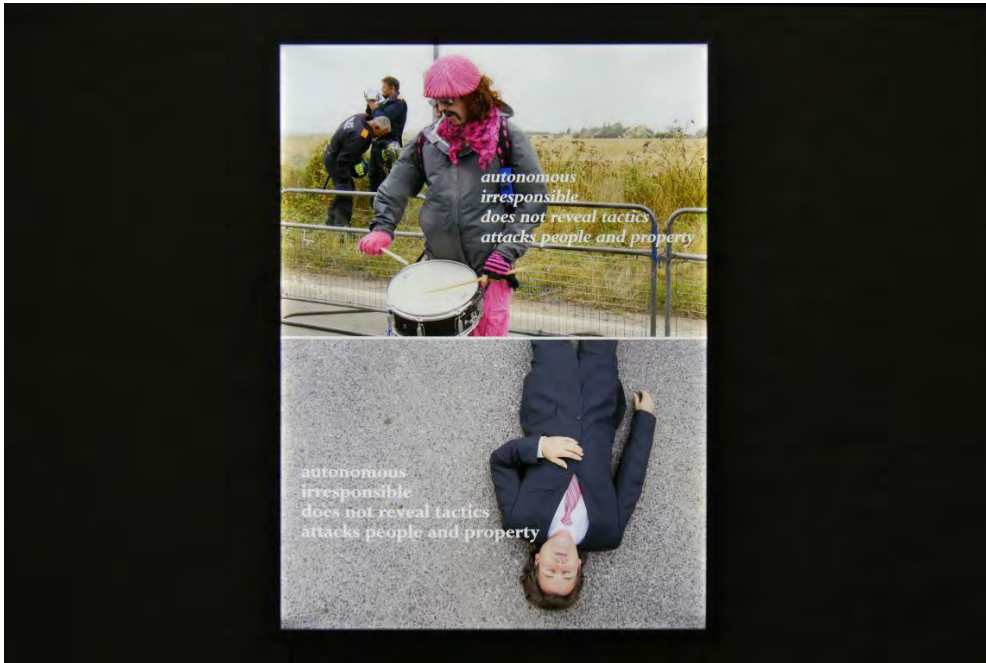
"For A Completely Different Climate" LED light box, 110 x 80 cm, 2008

growth. As noted in the installation's audio recordings, CO2 emissions continue to rise years after the signing of the Kyoto Protocol. Climate change could therefore only be confronted through a radical transformation of society that would effectively challenge the existing distribution of wealth and power-relationships that are guaranteed by the military.