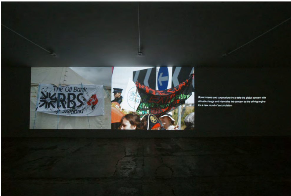
"For a Completely Different Climate". Installation view: "For A Completely Different Climate" (solo show), Galleria Artra, Milan, 2008