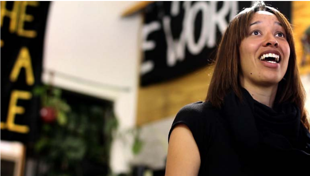
"In the Red", still