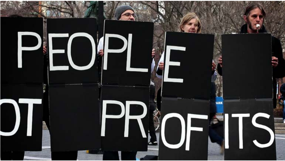
"In the Red", still