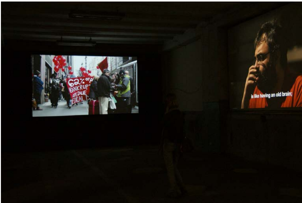
"In the Red". Installation view: "Installation view: "Political Imaginaries: Making the World Anew" (solo show), Wyspa Institute of Art, Gdansk, 2014