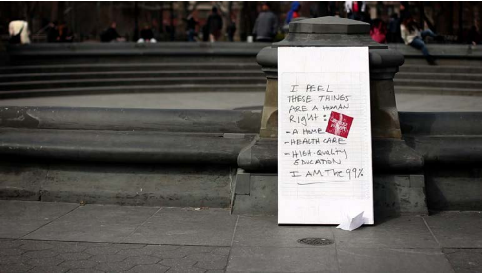
"In the Red", still