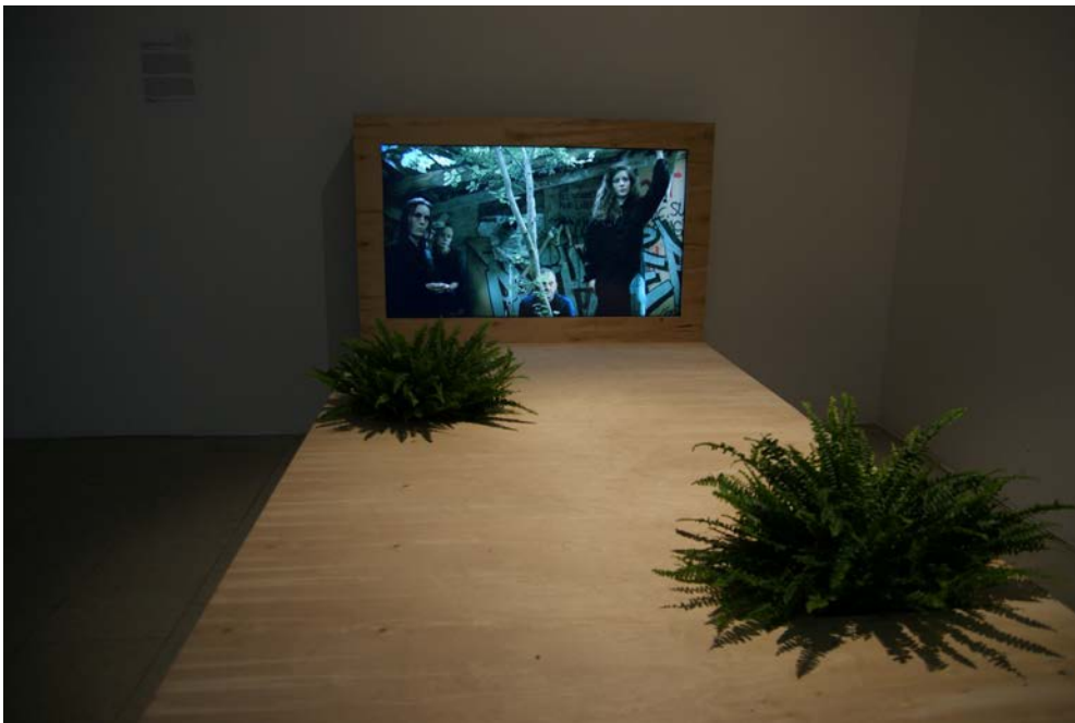
Field Work, "The Revenge of The Crystals". Installation view: "It's the Political Economy, Stupid", Pori Art Museum, Pori, 2013