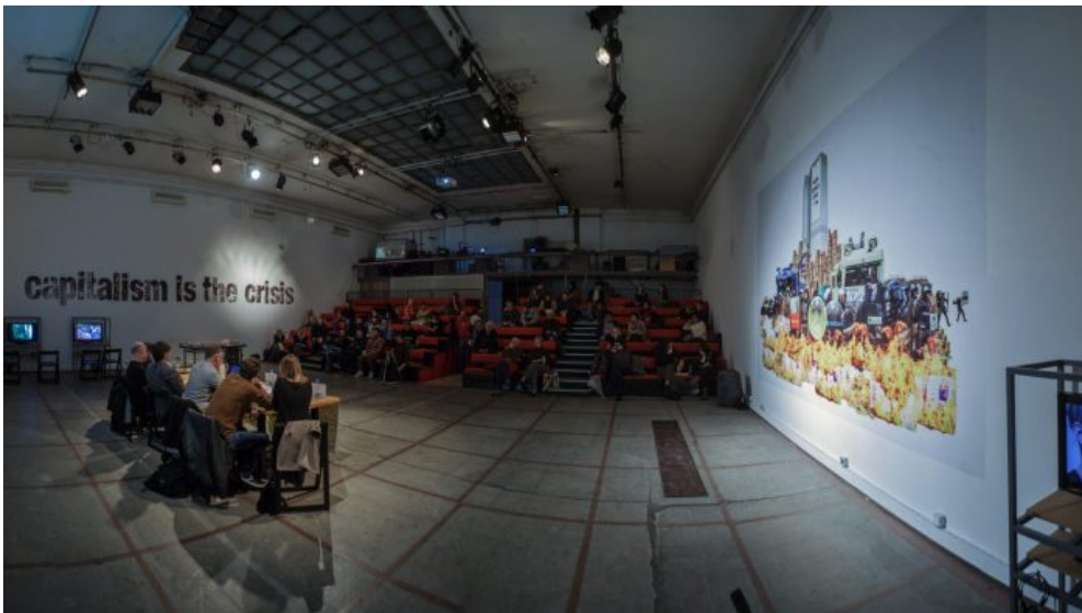
"It's the Political Economy, Stupid", Center for Cultural Decontamination, Belgrade, 2013