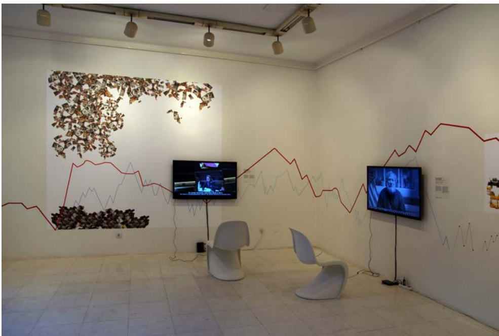
Noel Douglas, "Abstract Forces"; Libia Castro & Ólafur Ólafsson, "Lobbyists"; Zanny Begg & Oliver Ressler, "The Bull Laid Bear". Installation view: "It's the Political Economy, Stupid", Galerija Nova, Zagreb, 2014

Today, we are facing a catastrophe of capitalism that has also become a major crisis for representative democracy. The very idea of the modern nation state is in jeopardy as the deterritorialized flow of finance capital melts down all that was solid into raw material for market speculation and bio-political asset mining. It is the social order itself, and the very notion of governance with its archaic promise of security and happiness that has become another kind of modern ruin. Theorist Slavoj Žižek puts it this way, 'the central task of the ruling ideology in the present crises is to impose a narrative which will place the blame for the meltdown not on the global capitalist system as such, but on secondary and contingent deviations (overly lax legal regulations, the corruption of big financial institutions, and so on).'[1]