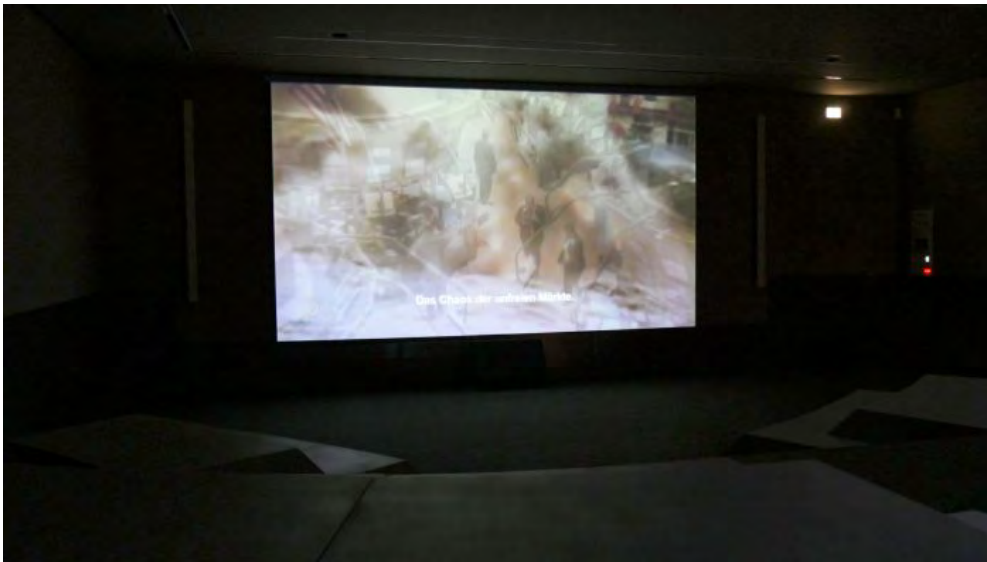
„Leave It in the Ground“. Installation view: „Facts & Fiction“, Städtische Galerie im Lenbachhaus und Kunstbau, Munich, 2015

Ground describes the climate crisis not as a technical and scientific problem, but as a political problem. The film discusses how ecological and humanitarian disasters caused through global warming might topple old orders and open up possibilities that could lead to long-term social and political transformations, both positive and negative.