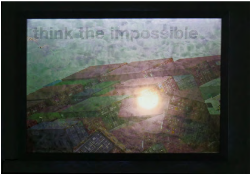
"Leave It in the Ground (Think the impossible)", LED lightbox, 84,1 x 59,4 cm, 2014