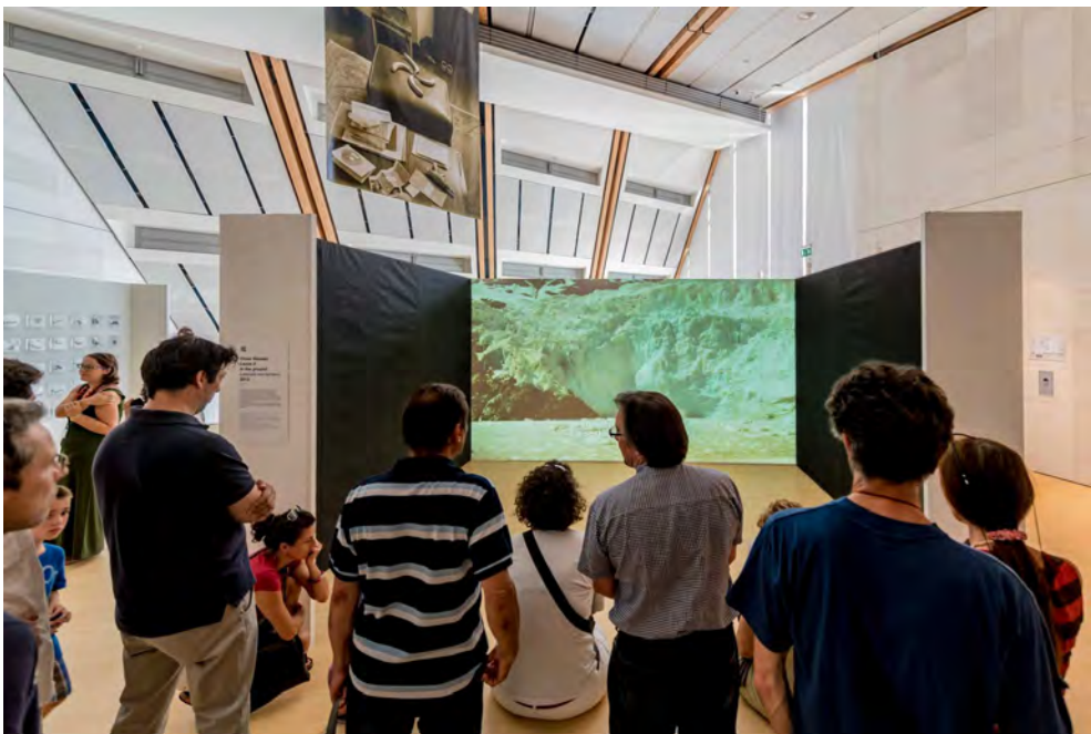
"Leave It in the Ground". Installation view: "Be-Diversity", Muse Museum Trento, Trento, 2015

Despite clear warnings, the ruling powers do not have a political agenda with a serious strategy to reduce use of fossil fuels, the main cause of global warming. Fossil-fuel fundamentalism seems to dominate throughout the globe.