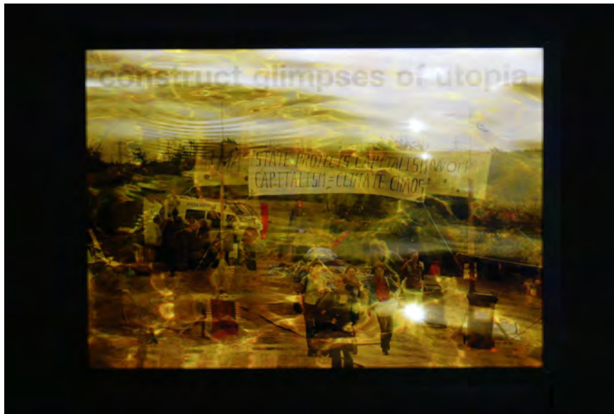
"Leave It in the Ground (Construct glimpses of utopia)", LED lightbox, 84,1 x 59,4 cm, 2014