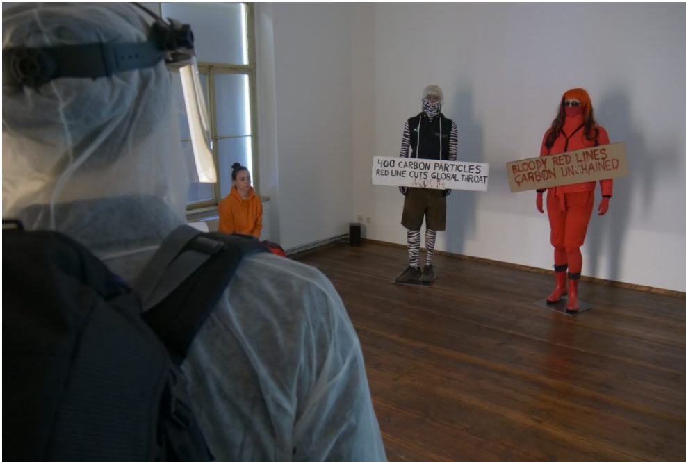
“New Model Army”, stand-in activists. Installation view: “Scharfstellen_1”, < rotor >, Graz, 2017

Bucharest. Others showed up in “The Extractive Machine – Neo-colonialisms and Environmental Resources” (2017) at the PAV (Parco Arte Vivente) in Torino. They surround the video installation “Everything’s coming together while everything’s falling apart”, acting as a sort of silent entourage; in the future they will also appear separately. Rumours suggest that this army will grow over time.