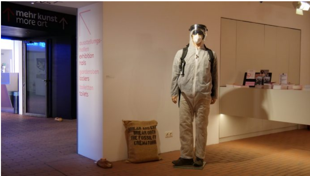
“New Model Army”, stand-in activist. Installation view: “...of bread, wine, cars, security and peace”, Kunsthalle Wien, Vienna, 2020