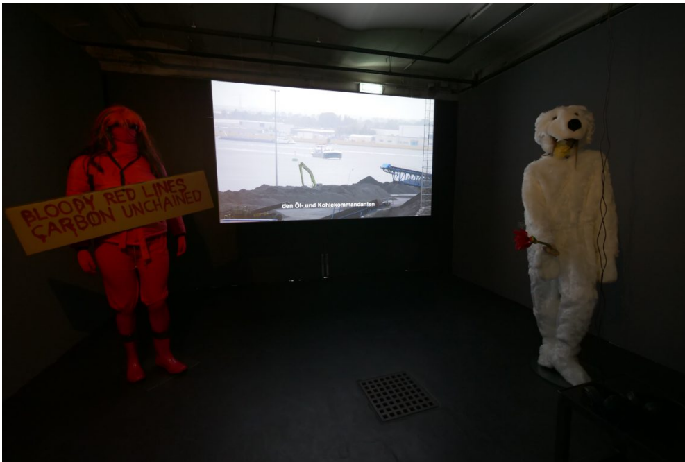
"New Model Army", stand-in activists. Installation view: "How to Occupy a Shipwreck" (solo show), Kunst Haus Wien, Vienna, 2018

"New Model Army" breaks the official silence, bringing spectres of the unseen climate movement protagonists into the gallery in the form of life-size mannequins. The mannequins stand in for activists whose civil disobedience ensures that no new eco-looting enterprise, however routine it may seem to stockholders, can ever be considered a done deal. These models are not even a perfect template or paradigm: something real but not yet real enough; container of the Geist of something still to come. The mannequins are stand-ins, visible ciphers for the unseen action of the climate movement everywhere. The modified mannequins hold up headline-style slogans concerning the crossing of the 1.5° threshold, e.g. "BLOODY RED LINES: CARBON UNCHAINED" and "400 CARBON PARTICLES – RED LINE CUTS GLOBAL THROAT".