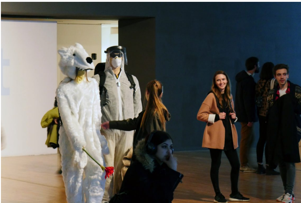
"New Model Army", stand-in activists, 2016. Installation view: "Property is Theft" (solo show), MNAC – National Museum of Contemporary Art, Bucharest, 2016

One mannequin is dressed as a polar bear – a species whose survival is threatened as the Arctic sea-ice falls away from under its feet. Another is the double of an Ende Gelände activist – one of thousands who shut down Europe’s filthiest coal-fired power plant and thousands everywhere intent on spoiling carbon-fattened business plans. A mannequin all in red stands for a climate movement axiom: “BE THE RED LINE”. If institutions ignore the difference between life and planetary death, only we can make the line impossible to cross. The fourth climate warrior seems poised for self-defence against violent police. Not spoiling for a fight, but unwilling to bow to the riot squad ranks in armed occupation of the streets. The first two activist figures from the “New Model Army” were seen together in Oliver Ressler’s solo exhibition “Property is Theft” (2016) at MNAC – National Museum of Contemporary Art in