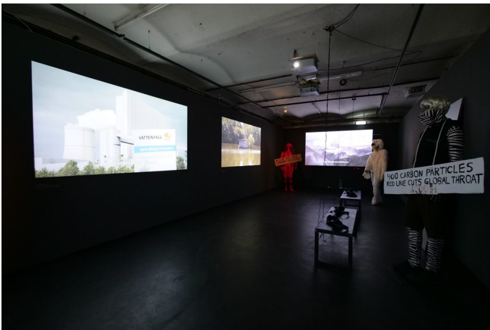
“New Model Army”, stand-in activists. Installation view: “How to Occupy a Shipwreck” (solo show), Kunst Haus Wien, Vienna, 2018

Meanwhile, a new social movement – the climate movement – has formed in response to dominant states’ refusal to cut CO2 emissions, much less take seriously the threat of irreversible ruin. This movement is bigger and more unified than it looks, because spectators see only occasional footage of isolated “newsworthy” interventions rather than the relentless pressure exerted by activists all over the world. The movement will not negotiate “concessions” from extractive industries. It will not be bought off with eco-crime-scene jobs, royalty deals, belated observance of safety standards or conscience-cleansing carbon offset programs. It just says “NO”.