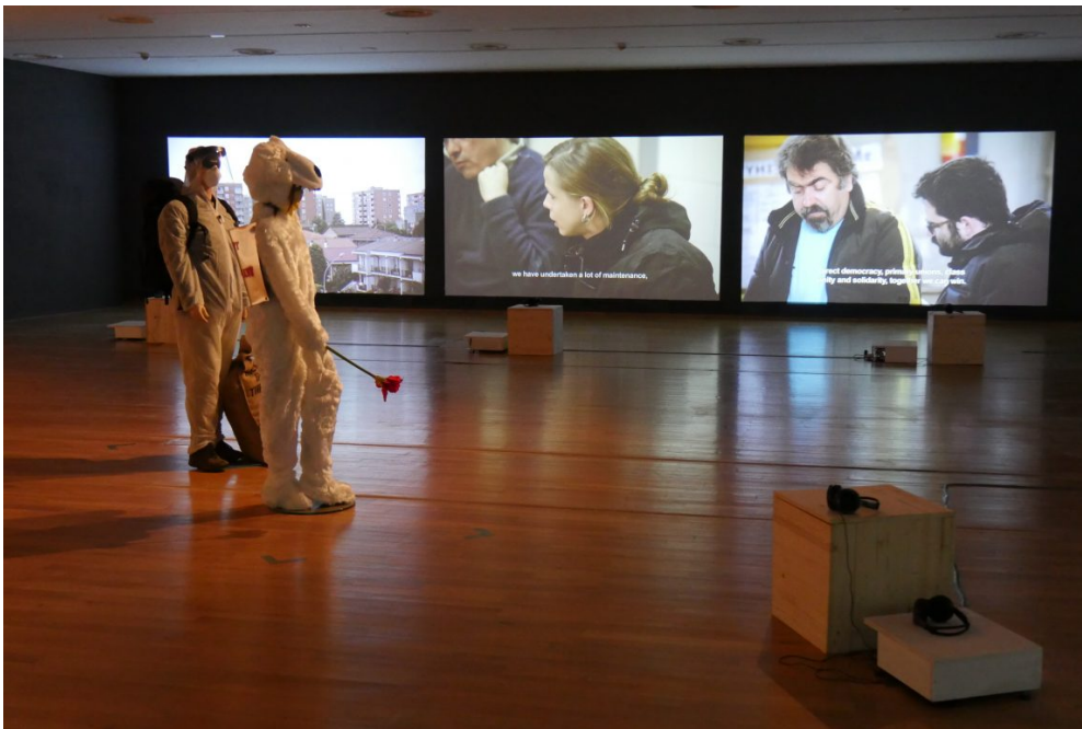
"New Model Army", stand-in activists, 2016. Installation view: "Property is Theft" (solo show), MNAC – National Museum of Contemporary Art, Bucharest, 2016