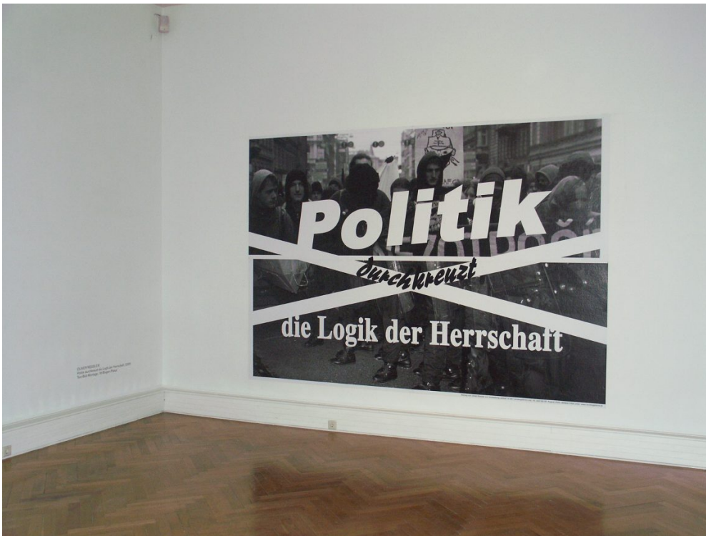
"Politics thwarting the logic of rule" ("Politik durchkreuzt die Logik der Herrschaft"), 16-sheet billboard. Installation view: "Police", Landesgalerie Linz am Oberösterreichischen Landesmuseum, Linz, 2005