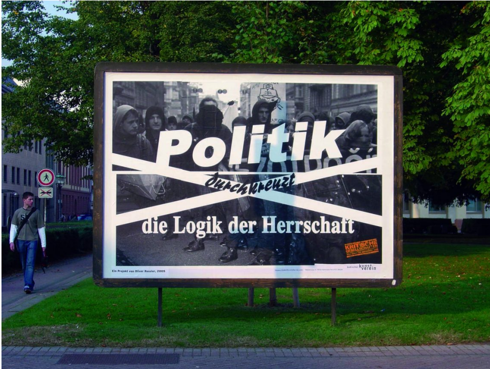
“Politics thwarting the logic of rule” (“Politik durchkreuzt die Logik der Herrschaft”), 16-sheet billboard, Karlsruhe, 2005

this distribution is implemented. I suggest that this process of distribution and the system of these legitimations should be given another name instead. My suggestion is that the process should be referred to as police. It is probable that a number of problems will result from the use of this term. The word “police” commonly conjures up an image of what we designate as the generically lower police, the truncheon-wielding force of law and order and the inquisitions conducted by the secret police. [...]