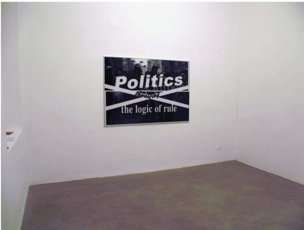
"Politics thwarting the logic of rule", digital print behind acrylic glass, 160 x 113 cm, 2005. Installation view: "Globalizing Protest" (solo show), Galleria Artra, Milan, 2005