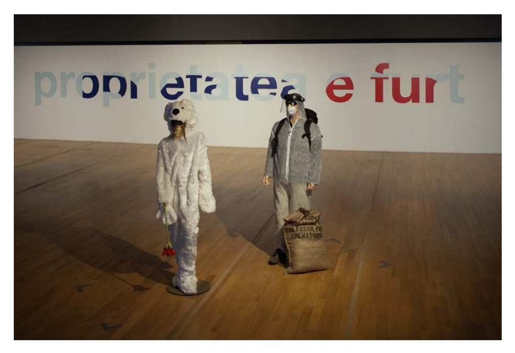
"Property is theft", wall text, 2016; "New Model Army", stand-in activists, 2016. Installation view: "Property is Theft", MNAC – National Museum of Contemporary Art, Bucharest, 2016

Property is theft! (La propriété, c'est le vol!) , the famous declaration made by French anarchist Pierre-Joseph Proudhon in 1840, serves as the title of Austrian artist Oliver Ressler's rst sur vey exhibition in Romania. The crisis of neoliberal capitalism is Oliver Ressler's favourite theme throughout his activity over the past twenty years, which can be seen as an investigation of the fundamentally economic understructure of all present social imbalances.