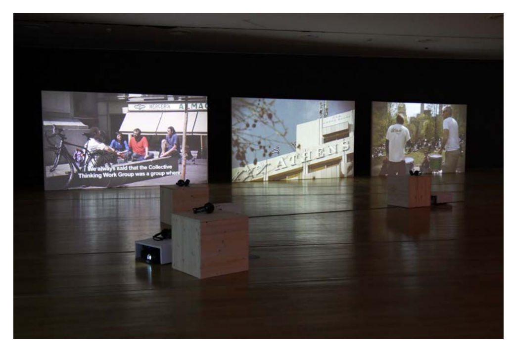
"Take The Square", 3-channel video installation, 2012. Installation view: "Property is Theft", MNAC – National Museum of Contemporary Art, Bucharest, 2016

Oliver Ressler's new 2-channel video installation "Everything's coming together while everything's falling apart" was produced for this exhibition with the support of ERSTE Foundation, BKA – Kunst and Otto Mauer Fonds.