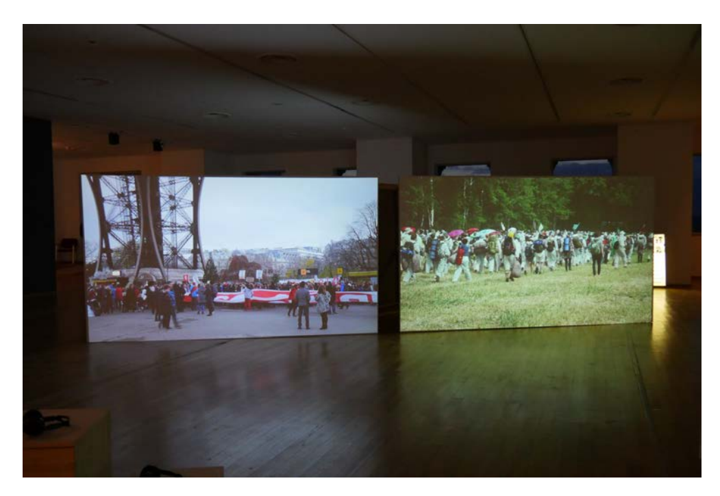
"Everything's coming together while everything's falling apart", 2-channel video installation, 2016. Installation view: "Property is Theft", MNAC – National Museum of Contemporary Art, Bucharest, 2016

and the social movement to them – the strikes, protests, blockades of fossil fuel industry and occupation of factories and squares ( Occupy! ) that have recently occurred. In the context of aggravating ecological, social and political problems, Oliver Ressler tackles the current economic crisis through a range of kaleidoscopic points of view around one single profound, apparently insolvable issue: contemporary capitalism.