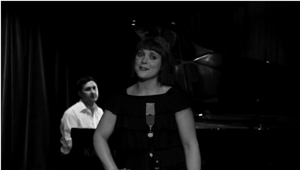
"The Bull Laid Bear", still