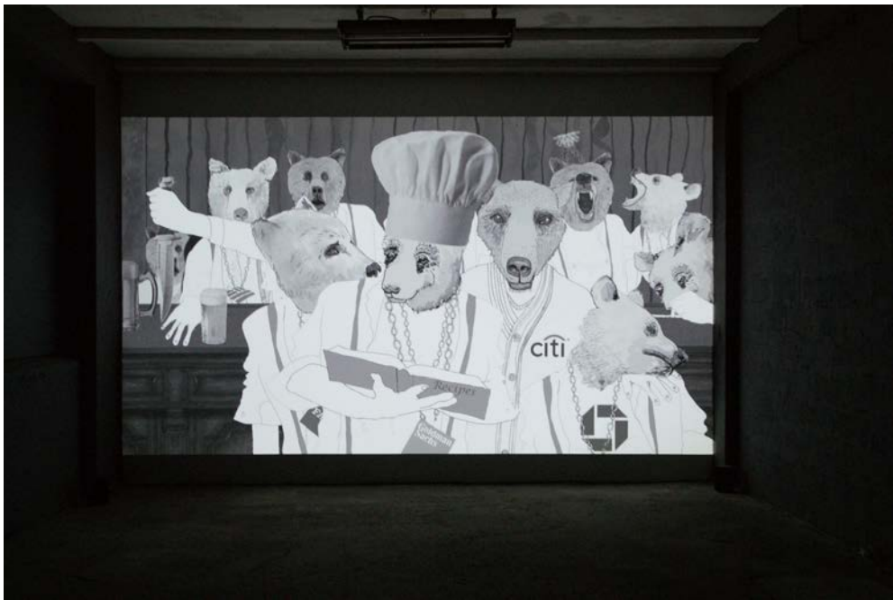
"The Bull Laid Bear". Installation view: "Political Imaginaries: Making the World Anew" (solo show), Wyspa Institute of Art, Gdansk, 2014