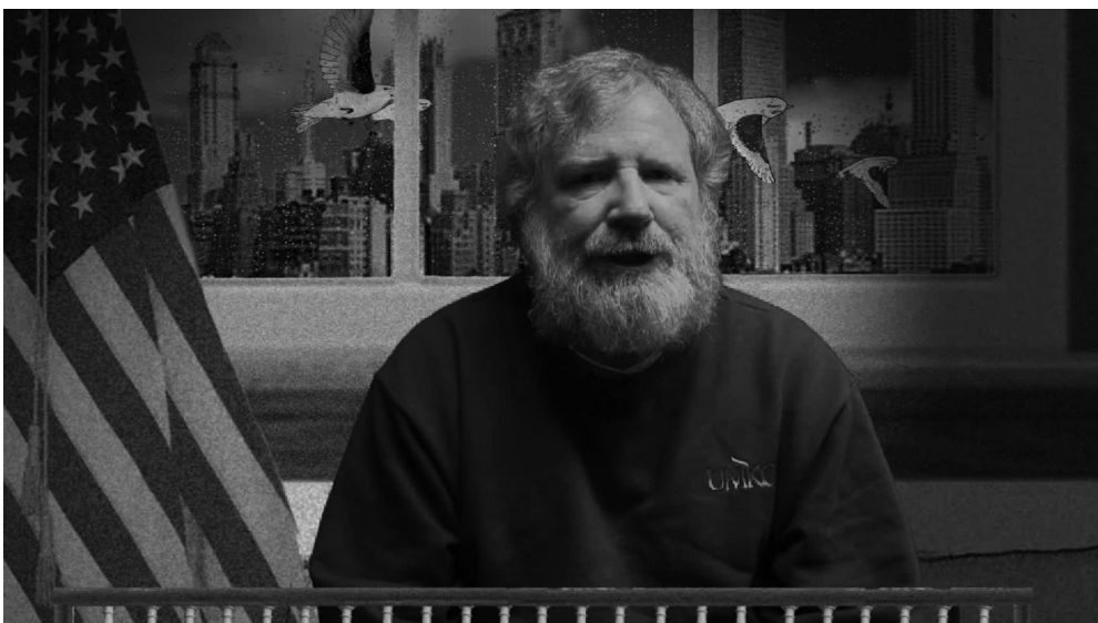
"The Bull Laid Bear", still

Financial assistance provided by Kulturamt der Steiermärkischen Landesregierung and Australia Council for the Visual Arts New Work Grant.