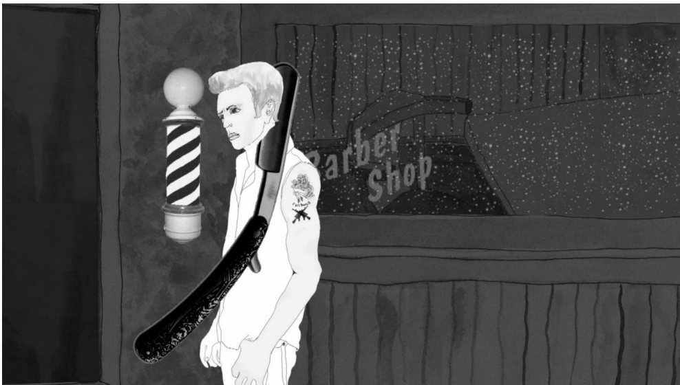
"The Bull Laid Bear", still

The Bull Laid Bear probes our collective "belief" in financial markets, unravelling responsibility for the 2008 financial meltdown and looking at some of the causes of the spiralling economic crisis in Europe.