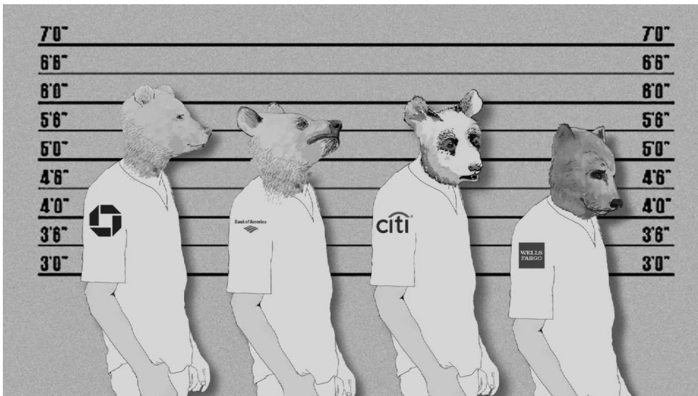
"The Bull Laid Bear", still

In their second collaborative film Zanny Begg (Sydney) and Oliver Ressler (Vienna) focus on the financial and economic crisis post 2008. The Bull Laid Bear "lays bare" the economic recession (bear market) that hides behind each boom time (bull market). The film pokes fun at the slippery justifications made for the bailouts and austerity packages by exploring how governments in the United States, and other countries such as Ireland, turned a banking crisis into a budgetary crisis at the governmental level.