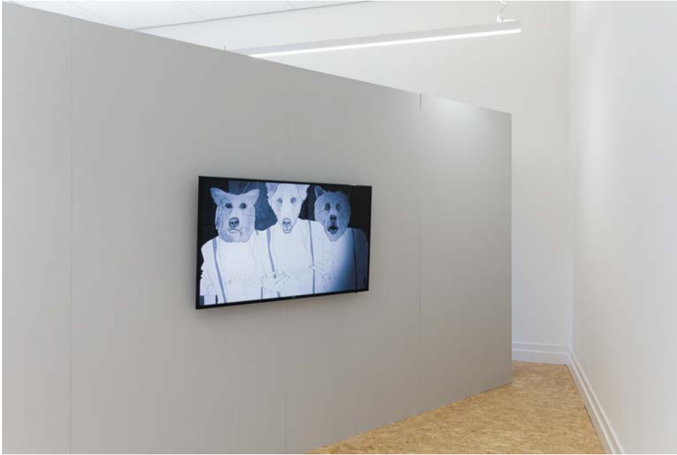
"The Bull Laid Bear". Installation view: "Taxed to the Max", Noorderlicht International Photography Festival 2019, Groningen, 2019

been blended with hand drawn animations to create a quasi-fictitious criminal world of gangster bankers and corrupt courts.