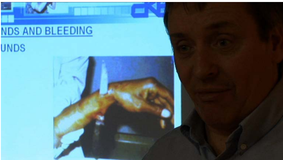
"The Fittest Survive", still