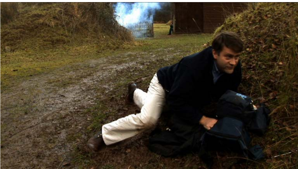
"The Fittest Survive", still

The video "The Fittest Survive" is based on footage of the five-day course "Surviving Hostile Regions", run by AKE Group in Wales (UK) in January 2006. The course instructors are former soldiers of the British Special Forces. Some of the participants are executives preparing for business in Iraq or other dangerous regions. Some are government officials on their way to the new protectorates. Still others are journalists soon to be formally or otherwise "embedded", which is to say: regardless of personal honesty, their words will appear only when they echo a spurious (historically clueless) discourse of democracy and human rights, helping scorched-earth market expansion on its way.