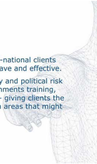
"The Fittest Survive", still

AKE has spent over a decade showing multi-national clients how to assess and mitigate risks and stay safe and effective. We deliver internationally acclaimed security and political risk management, which includes hostile environments training, skills, intelligence, equipment and services - giving clients the competitive advantage of engaging safely in areas that might otherwise have been closed to opportunity.