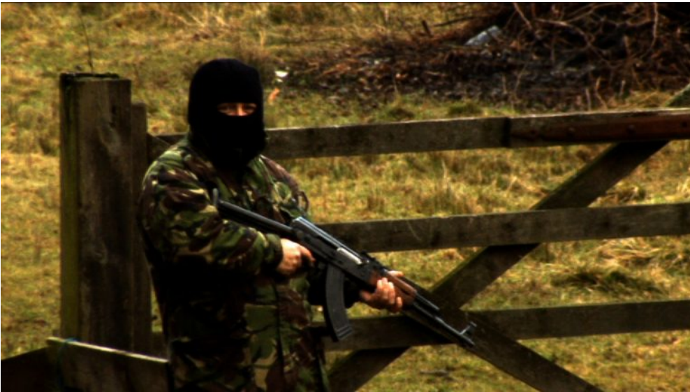
"The Fittest Survive", still

The video "The Fittest Survive" is based on footage of the five-day course "Surviving Hostile Regions", run by AKE Group in Wales (UK) in January 2006. The course instructors are former soldiers of the British Special Forces. Some of the participants are executives preparing for business in Iraq or other dangerous regions. Some are government officials on their way to the new protectorates. Still others are journalists soon to be formally or otherwise "embedded", which is to say: regardless of personal honesty, their words will appear only when they echo a spurious (historically clueless) discourse of democracy and human rights, helping scorched-earth market expansion on its way.