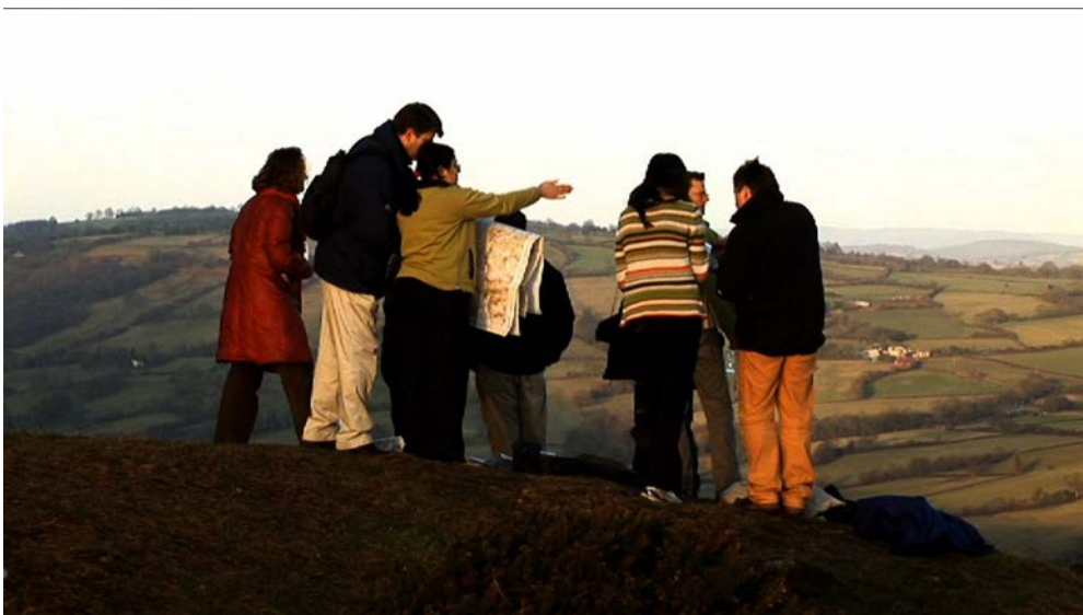
"The Fittest Survive", still