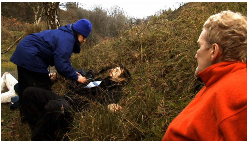
"The Fittest Survive", still

Concept, Film Editing, Production: Oliver Ressler