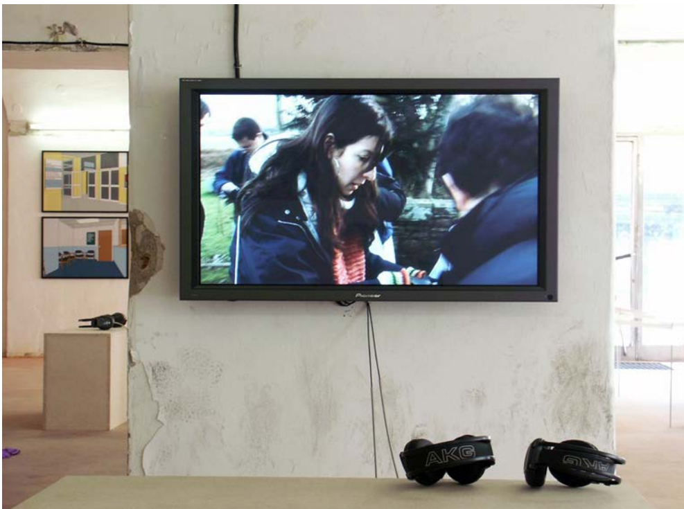
"The Fittest Survive". Installation view: "Traurig sicher, im Training", Grazer Kunstverein / Steirischer Herbst, Graz, 2006

"Risk" and "danger", "disaster" and "wilderness" are no longer the disavowed flipside of the globalisation dream. These erstwhile deterrents are factors to be calculated, mastered, hedged and traded by the best and strongest: a "challenge", an "opportunity" and a useful test of the ruthlessness required from economic "achievers". Crisis regions are growth areas: frontier markets multiply the blood spilled on former colonial frontiers. The essentially warlike character of market economics demands the impossible , making life a battleground where the stakes of "satisfactory performance" are murderous and suicidal.