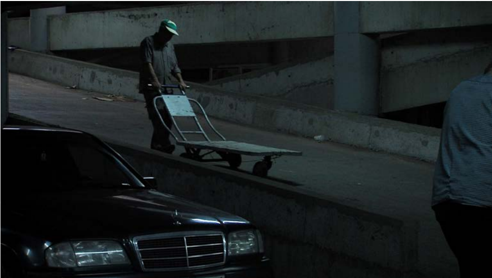
"The Plundering", still