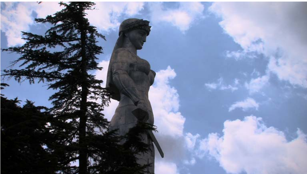
"The Plundering", still

The film The Plundering focuses on four cases of aggressive, state-property privatization policies in Tbilisi. Through interviews, it discusses the privatization of the water system in Tbilisi and of Tbilisi's popular market, the Dezserter Bazaar . A newly emerging movement prevented the attempted sell-off of the National Scientific Library, and the destruction and conversion of the historical Gudiashvili Square in Tbilisi's city center into a shopping mall.