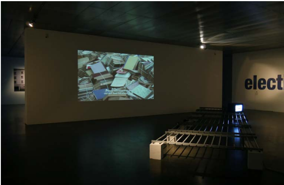
"The Plundering". Installation view: "The Plundering" (solo show), Lentos Kunstmuseum, Linz, 2014

Extreme levels of privatization can only be carried out under conditions where people are under severe pressure, as in the transformation of former Soviet republics towards independence and capitalism. Since the Rose Revolution in 2003, the former Soviet republic Georgia underwent such a radical transformation. President Mikheil Saakashvili implemented one of the most extreme neoliberal projects in the world. Today, Georgia is 9th of 185 states in the World Bank ranking "Ease of Doing Business". While the "common good accumulated within the communist regime during 70 years of its existence" (Rusudan Mirzikashvili, The Plundering ) is being sold off, the unstable situation in a radical, free-market economy and the liquidation of most social safety nets drove most Georgian residents into un-experienced levels of poverty.