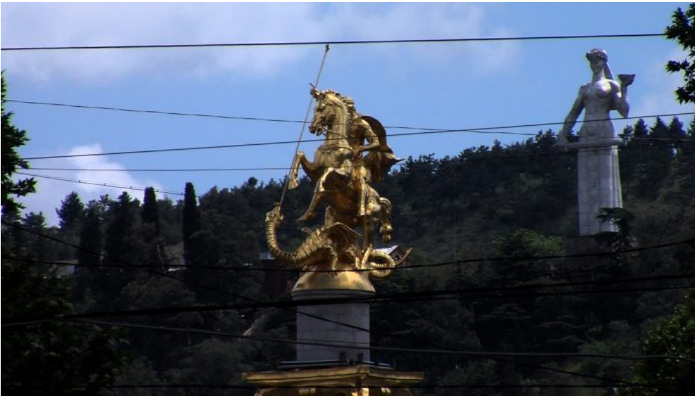
"The Plundering", still