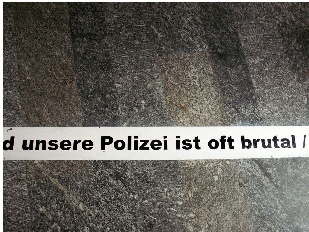
"Erich Fried Passage", theme-specific permanent installation, Kapfenberg, 2002

"In an era of steadily growing multinational capitalist weavings, we can, for example, think of new concepts of socialism that don't eliminate capitalism, that replace class struggle with social partnership. What we can't do is believe in such a maneuver deep inside."