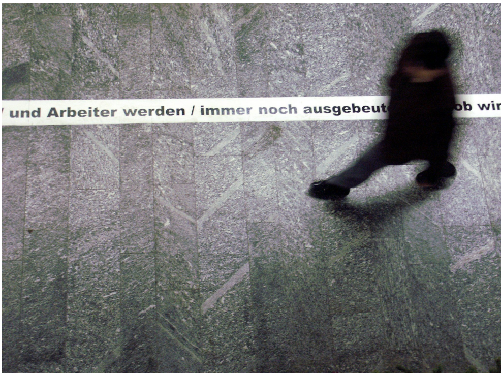
"Erich Fried Passage", theme-specific permanent installation, Kapfenberg, 2002

The light box as an advertising medium is a reference to the continued relevance of Fried's persuasion. Proceeding from this light box, in the passageway where the entrances to the offices of Kapfenberg's municipal authorities can be found, are the following texts from Erich Fried displayed in a 46 m long and 17 cm wide white and black floor graphic: