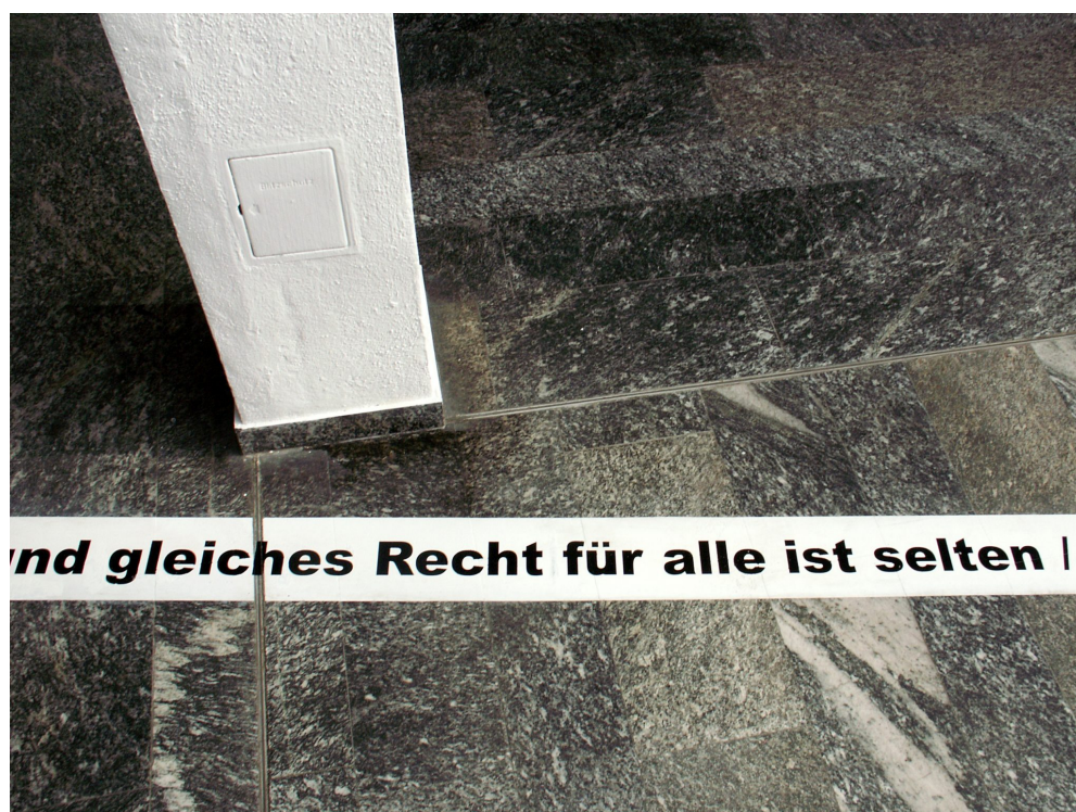
"Erich Fried Passage", theme-specific permanent installation, Kapfenberg, 2002