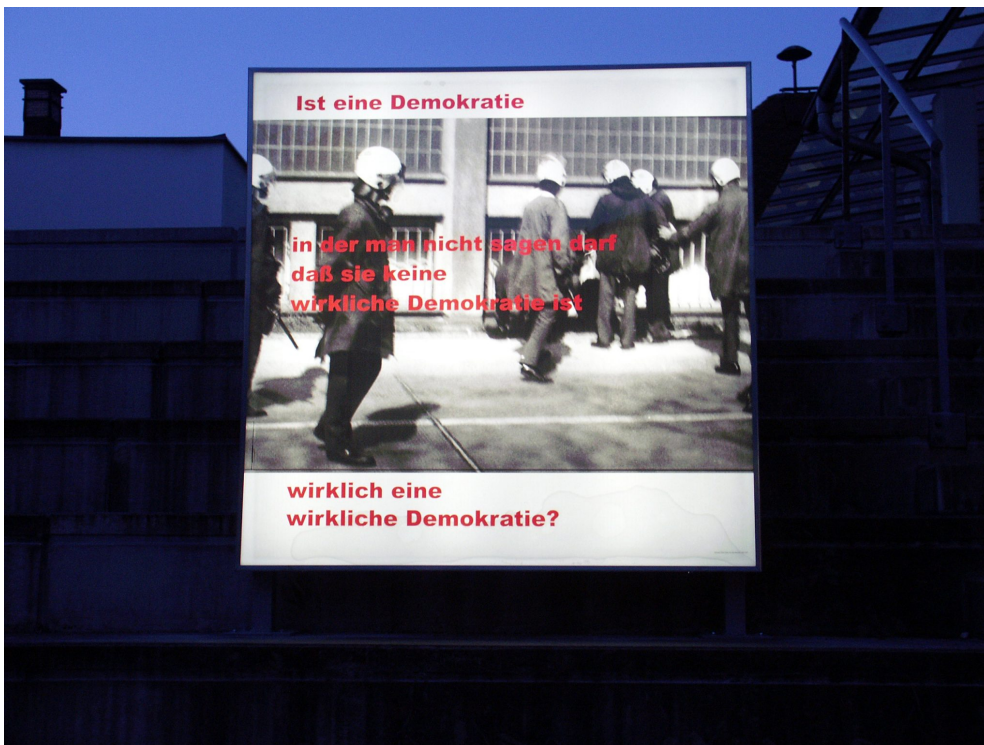
"Erich Fried Passage", theme-specific permanent installation, Kapfenberg, 2002

By following and reading the floor text on the ground, the second light box becomes visible in the new part of the passageway. Set above a photo that shows several police officers in helmets, who have obviously pushed a demonstrator to the ground, is an excerpt from Fried's poem "Zur Kenntlichkeit" (On recognisability) from 1975–1977: