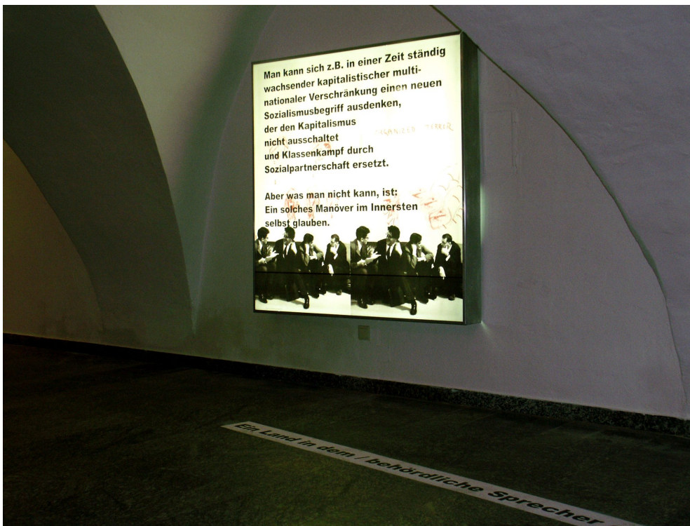
"Erich Fried Passage", theme-specific permanent installation, Kapfenberg, 2002