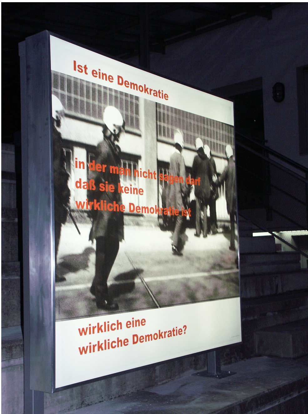
"Erich Fried Passage", theme-specific permanent installation, Kapfenberg, 2002

Oliver Ressler's installation consists of two 1.5 x 1.5 m light boxes and a 46 m long floor text in the center of Kapfenberg. The text/image montages in the two light boxes combine thematic and associative text excerpts from Erich Fried's literary work with photographs and a drawing from his estate. The selected texts are concerned with the capitalist system, possible alternatives, and with socialism and issues of democracy. This thematic concentration forms the connecting link between the political position and literature of Fried and the history and present life in the Upper Styrian industrial town of Kapfenberg. The light box, installed in the old town passageway directly adjacent to the main square that was named for the resistance fighter Koloman Wallisch focusses on Fried's views of socialism and the worker's struggle based on excerpts from the text "Die Arbeiterbewegung als kulturelle Kraft" (The labor movement as cultural power) from 1987. The text states: