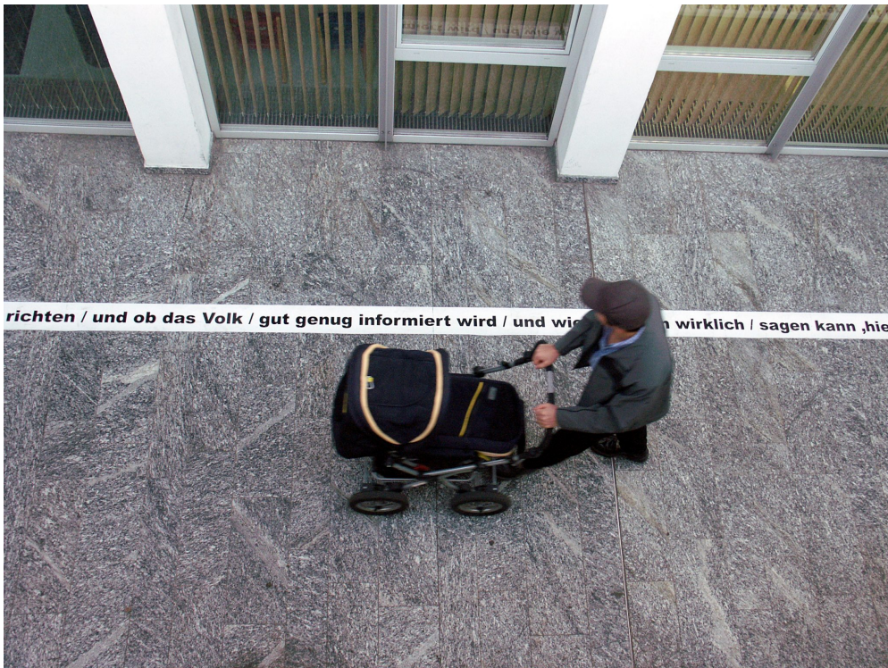
"Erich Fried Passage", theme-specific permanent installation, Kapfenberg, 2002