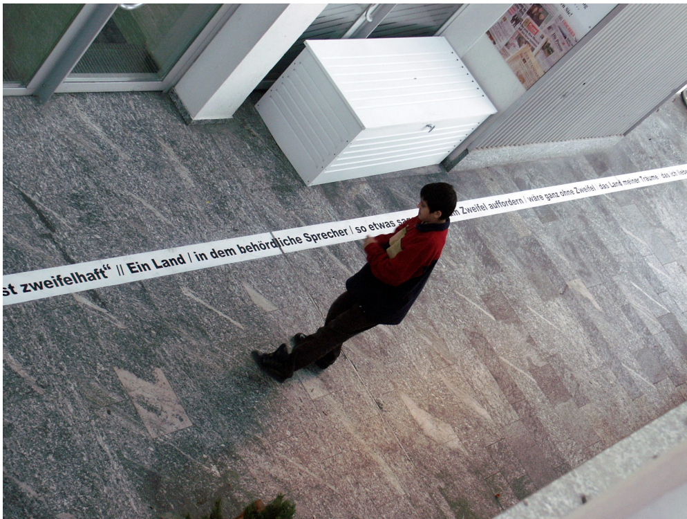
"Erich Fried Passage", theme-specific permanent installation, Kapfenberg, 2002