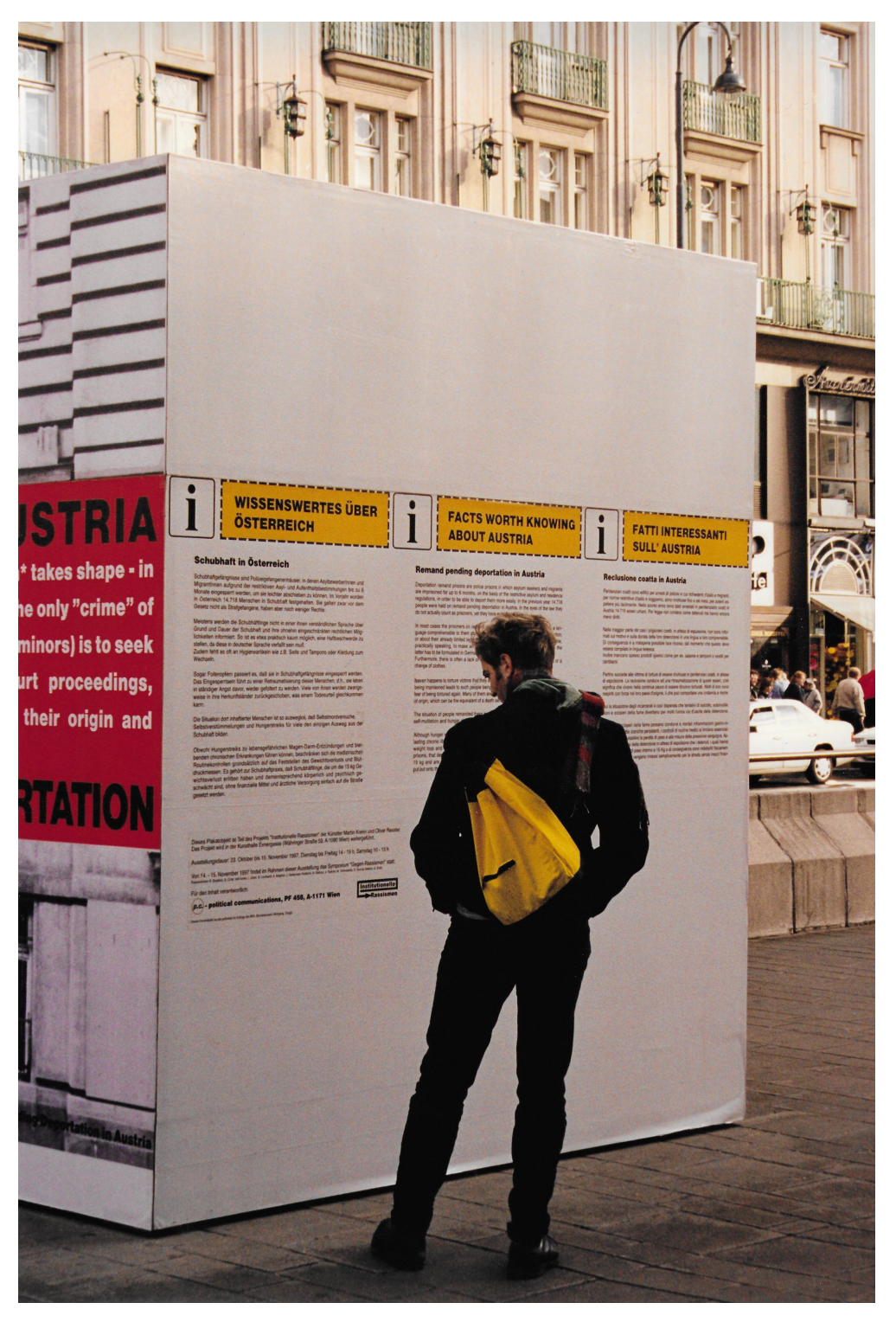
"Institutional Racisms", billboard object in front of the Viennese state opera, Vienna, 1997

In order to bring institutional racisms (in the form of state regulated racisms) into the focus of public attention, we placed a 3 \times 3 \times 3 m large poster object in the Viennese city centre on the Herbert-von-Karajan Square in front of the State Opera from 14.10. - 27.11.1997.