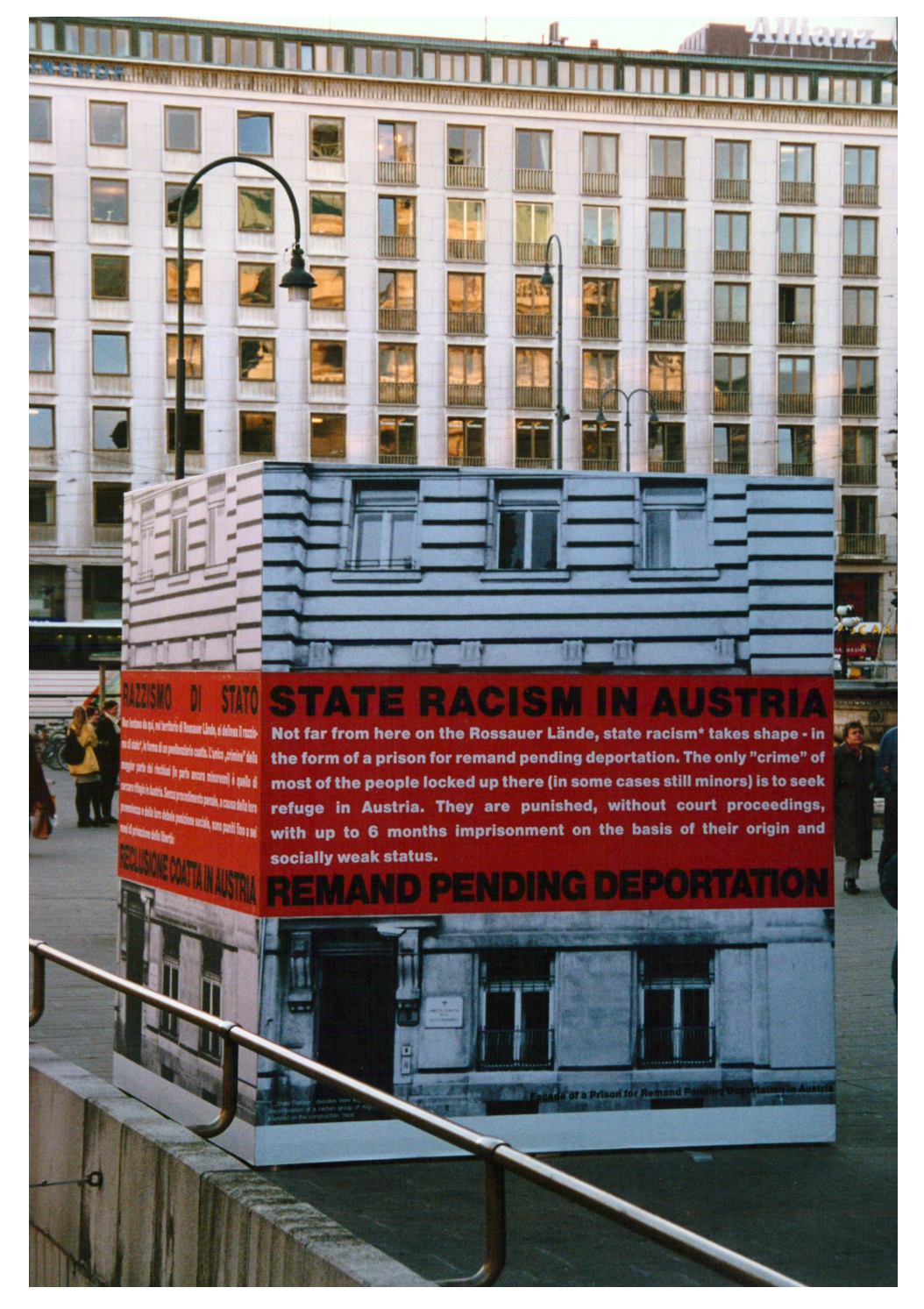
"Institutional Racisms", billboard object in front of the Viennese state opera, Vienna, 1997

Thus, in general, racist institutionalised practices towards migrants, refugees, and members of minorities are little considered. Often it is only extreme and violent racist attacks which draw the attention of the public. Such reduced modes of perception and observation define racism as a trivial problem. Through this process its present socio-political meaning is marginalised and ghettoised. While racism is seen as disassociated from the structure of the power relations in our society, its institutional achorings remain filtered out. Hand in hand with this goes the disregard for the social consequences of institutional racisms for migrants, refugees, and minorities. These viewpoints contribute to the reproduction and establishment of racisms.