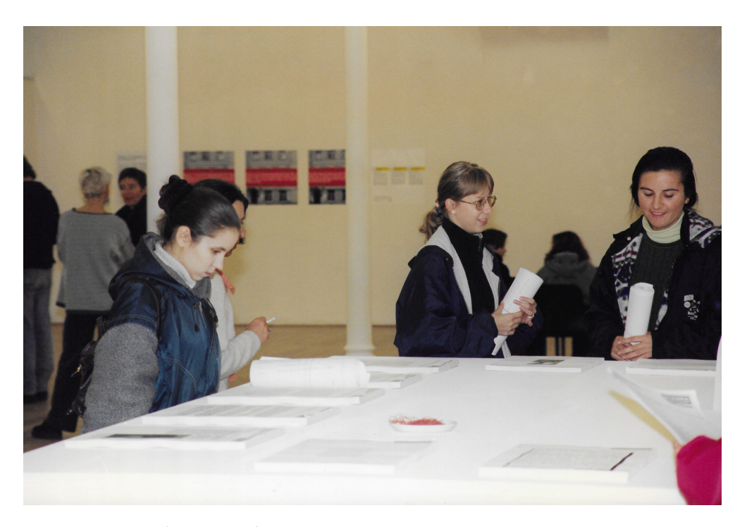
"Institutional Racisms" (solo exhibition), Kunsthalle Exnergasse, Vienna, 1997

Supplementing the video, selected information materials from anti-racist publications lay freely available for taking on three wood pedestals in the form of pads of sheets stuck together at one side. On a total of 54 pages an offensive stand against different forms of institutional racisms is made, among other things for an immediate abolition of prisons for remand pending deportation. A form of criticism which only independent, radical left, and thus generally low-circulation magazines achieve.