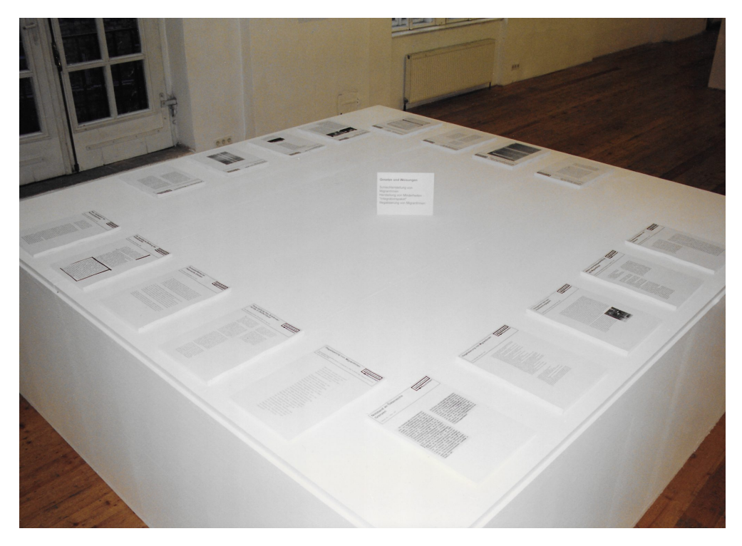
"Institutional Racisms" (solo exhibition), Kunsthalle Exnergasse, Vienna, 1997