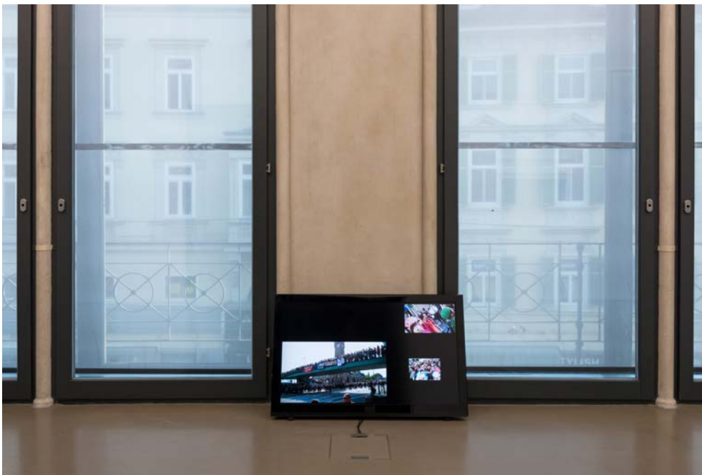
"A-Anti-Anticapitalista". Installation view: "Barricading the Ice Sheets" (solo show), Camera Austria, Graz, 2021.

The future success of the climate movement will depend on intersectional approaches, on the possibility of alliances with (for example) anti-racist and decolonizing movements, with movements against gender oppression and others fighting intolerable forms of labor exploitation. The slogan "A-Anti-Anticapitalista" is already heard in a wide variety of left political contexts. It points toward unity, pushing aside contradictions and participants' political differences in the moment of collective expression.