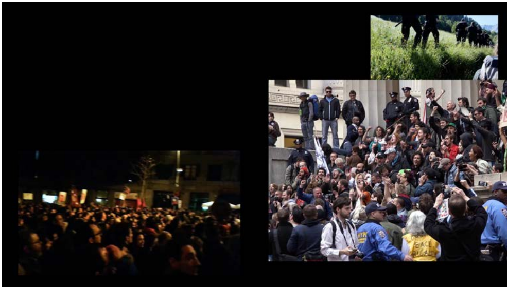
"A-Anti-Anticapitalista", 4K video, 2021

Everyone who ever protested knows the importance of meaningful slogans. A slogan especially favored in recent actions of the left is: "A-Anti-Anticapitalista". When chanted it allows for multiple variations of tempo and volume, drawing out its melodic and musical qualities. Often it is also modified semantically to fit the immediate local context.