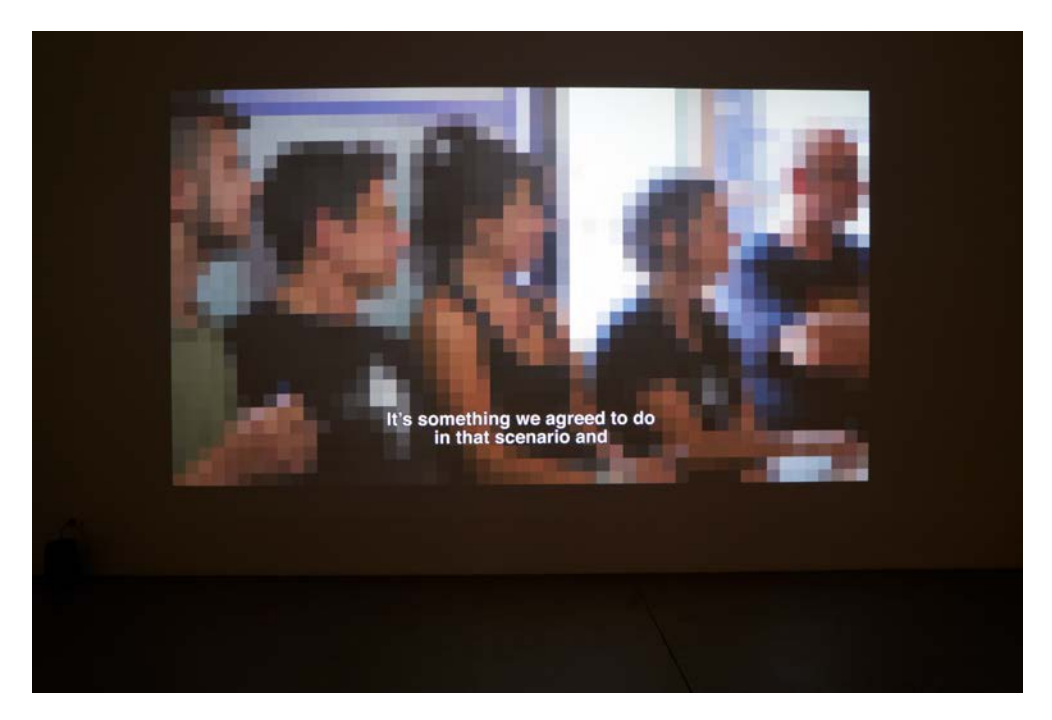
"Not Sinking, Swarming". Installation view: "Barricading the Ice Sheets" (solo show), Museum of Contemporary Art Zagreb, 2021.

Through the assembly discussion we learn how the network is structured around multiple commissions (working groups), each of which takes on a particular responsibility: communication, training, food, logistics, design of the action, strategy, legal support, interaction with police, demands, care and finance.