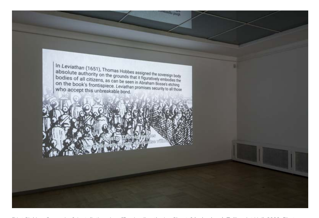
"Not Sinking, Swarming". Installation view: "Barricading the Ice Sheets" (solo show), Tallinn Art Hall, 2022.

Through the assembly discussion we learn how the network is structured around multiple commissions (working groups), each of which takes on a particular responsibility: communication, training, food, logistics, design of the action, strategy, legal support, interaction with police, demands, care and finance.