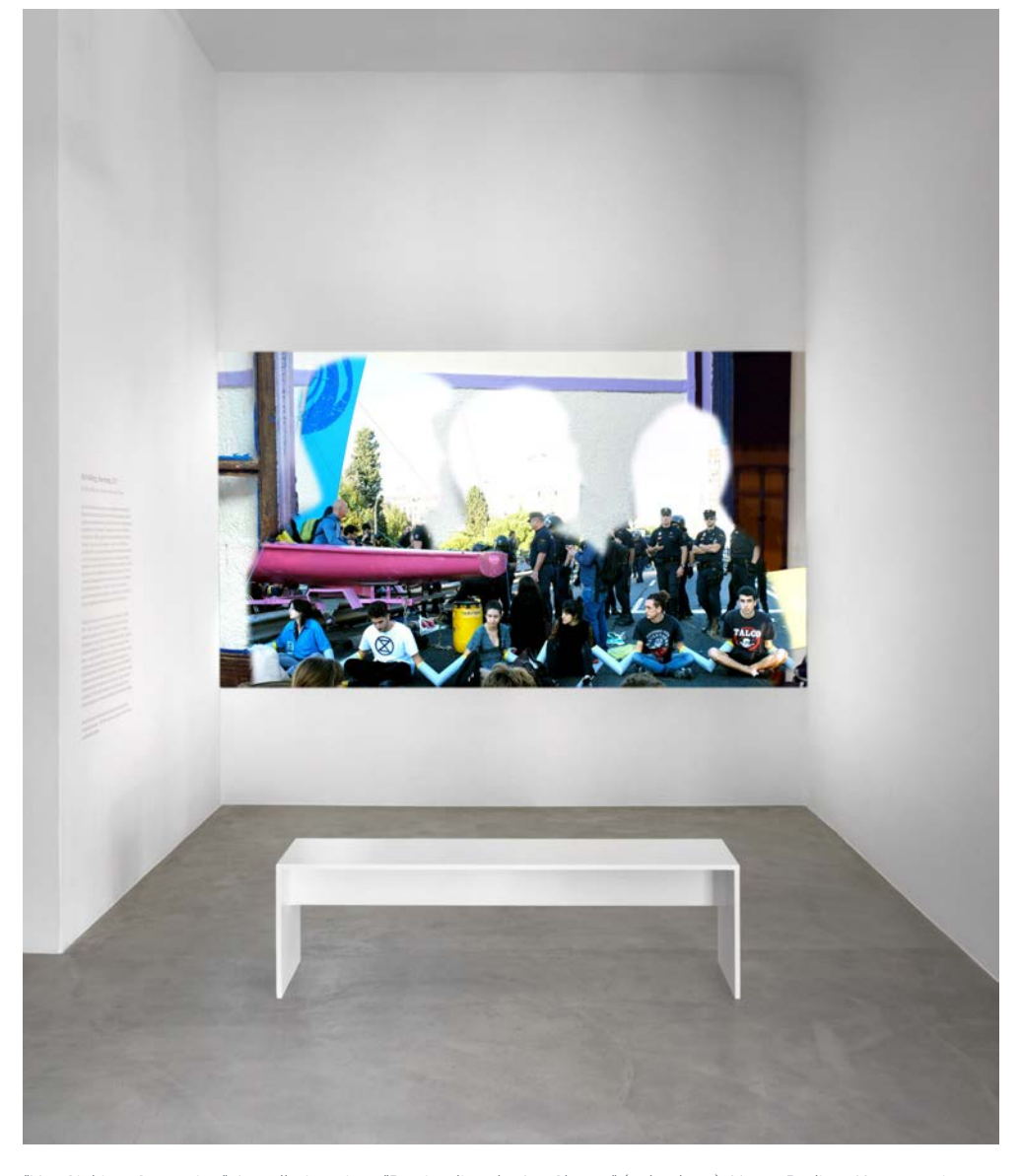
"Not Sinking, Swarming". Installation view: "Barricading the Ice Sheets" (solo show), Neuer Berliner Kunstverein, Berlin, 2022.