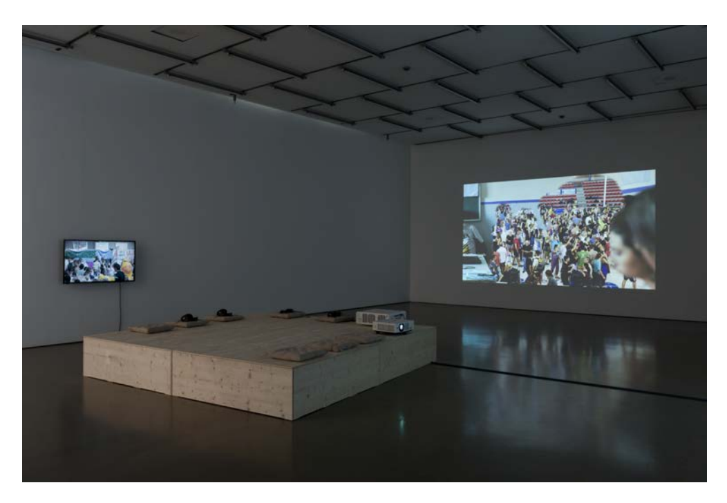
"Not Sinking, Swarming". Installation view: "Barricading the Ice Sheets" (solo show), Camera Austria, Graz, 2021.