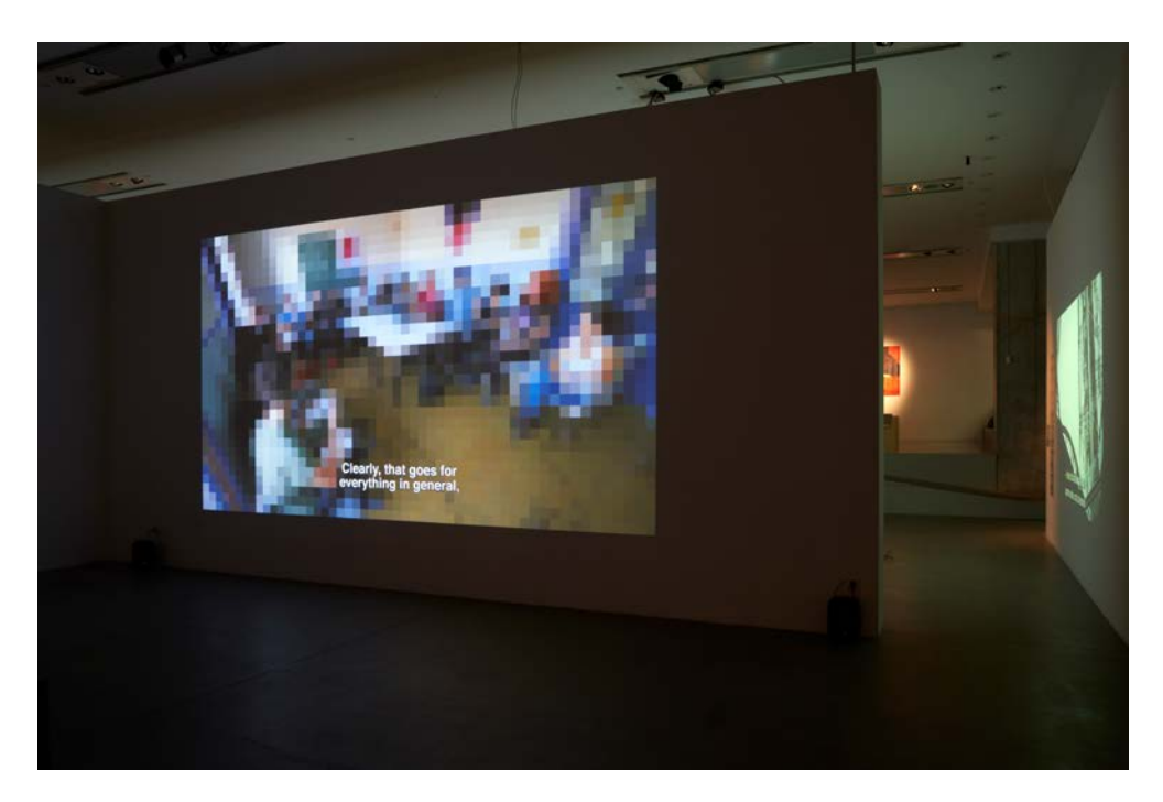
"Not Sinking, Swarming". Installation view: "Barricading the Ice Sheets" (solo show), Museum of Contemporary Art Zagreb, 2021.

This film originated in a four-hour assembly in Madrid in October 2019, where delegates from various environmental groups gathered to prepare an act of civil disobedience. The groups – Ecologistas en Acción, Alternativa Antimilitarista MOC, Legal Sol, Extinction Rebellion, Climacció, Fridays for Future and Greenpeace – are part of the platform By 2020 We Rise up , which is active throughout Europe and seeks to foster climate rebellion.