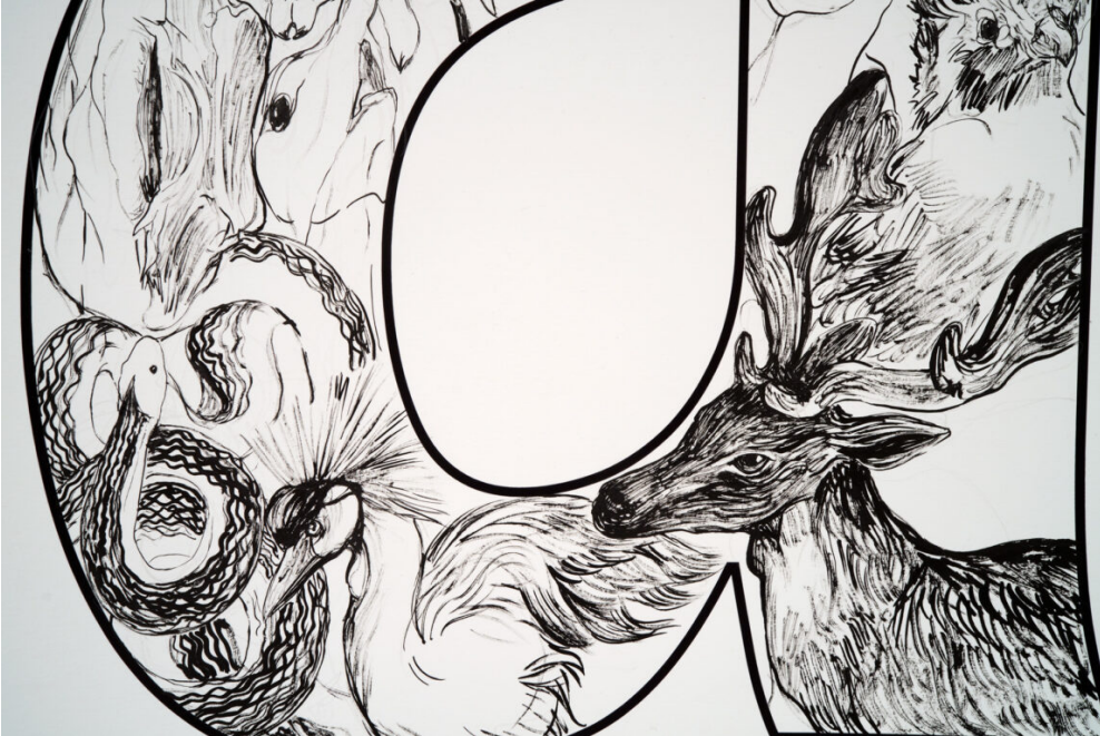
"Property Will Cost Us the Earth". Installation view: "Barricading the Ice Sheets" (solo show), Museum of Contemporary Art Zagreb, 2021.