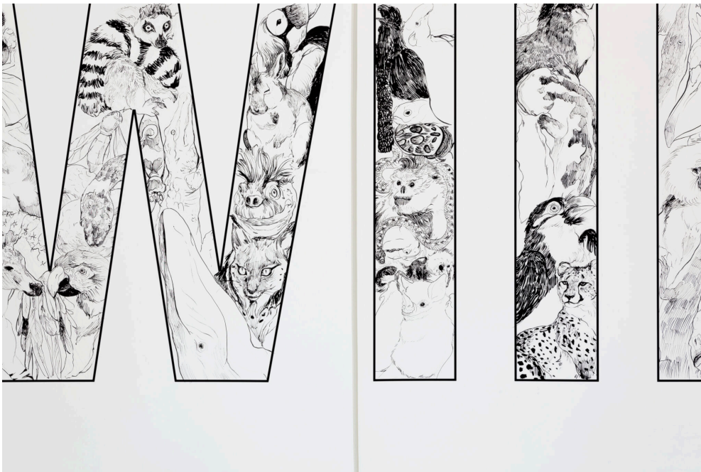
"Property Will Cost Us the Earth". Installation view: "Barricading the Ice Sheets" (solo show), Tallinn Art Hall, 2022.

From a distance, the fonts forming the large-scale text Property Will Cost Us the Earth look like irregular grey. On closer inspection, drawings of animals appear. The letters themselves consist of ink drawings of hundreds of threatened species of wildlife. The mammals, birds, fish, amphibia, reptiles and insects shown are all endangered: all appear in the IUCN Red List (2) of 38,500 species under threat of extinction.