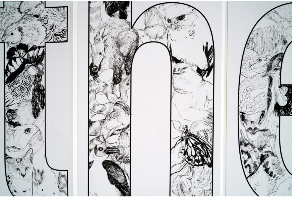
"Property Will Cost Us the Earth". Installation view: "Barricading the Ice Sheets" (solo show), Museum of Contemporary Art Zagreb, 2021.