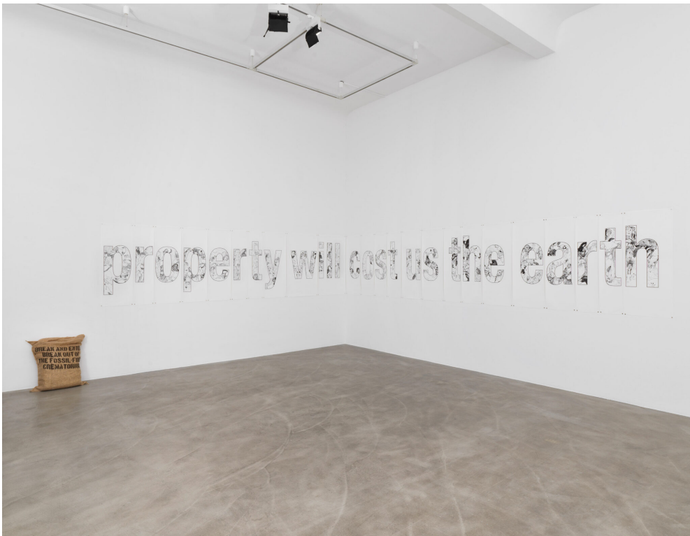
"Property Will Cost Us the Earth". Installation view: "Barricading the Ice Sheets" (solo show), Neuer Berliner Kunstverein, Berlin, 2022.