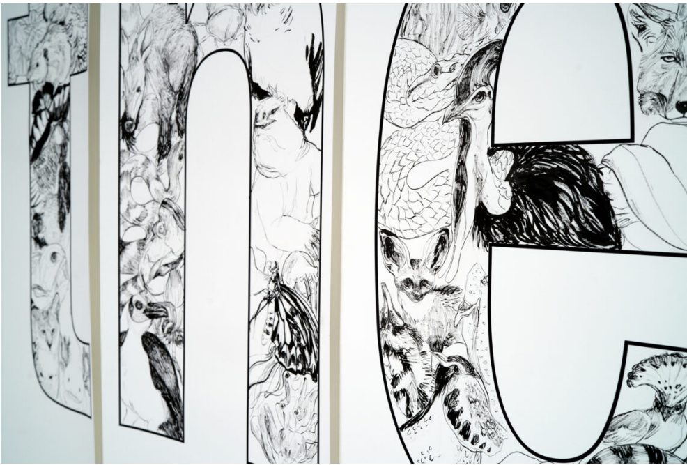
"Property Will Cost Us the Earth". Installation view: "Barricading the Ice Sheets" (solo show), Museum of Contemporary Art Zagreb, 2021.

The graphic images of Property Will Cost Us the Earth lay bare a graphic truth.