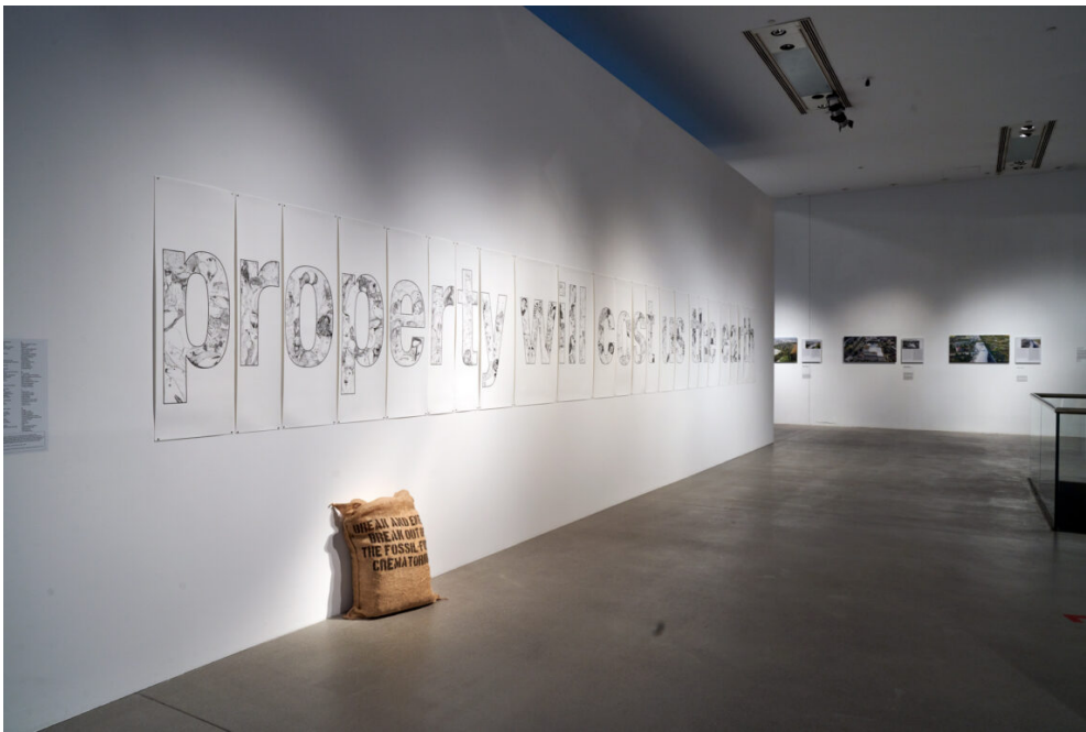
"Property Will Cost Us the Earth". Installation view: "Barricading the Ice Sheets" (solo show), Museum of Contemporary Art Zagreb, 2021.