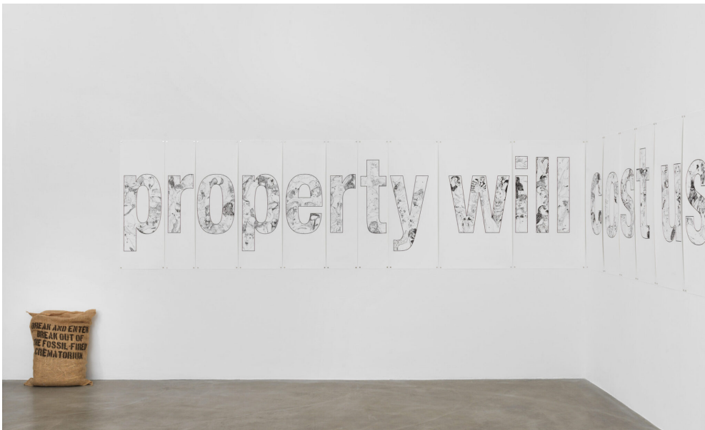
"Property Will Cost Us the Earth". Installation view: "Barricading the Ice Sheets" (solo show), Neuer Berliner Kunstverein, Berlin, 2022.

The title Property Will Cost Us the Earth comes from Andreas Malm's book "How to Blow Up a Pipeline" (1), in which the author shows that capital is responsible for the destruction of life and livelihood in an overheated world. He goes on from there to argue for the urgent necessity of a new wave of resistance, dedicated to the total global prohibition of new CO2-emitting devices. Assets must be stranded and investments written off. Yet no government on Earth dares lay a hand on allegedly sacrosanct property rights. This, writes Malm, is why the property must be seized by means of sabotage and destruction.